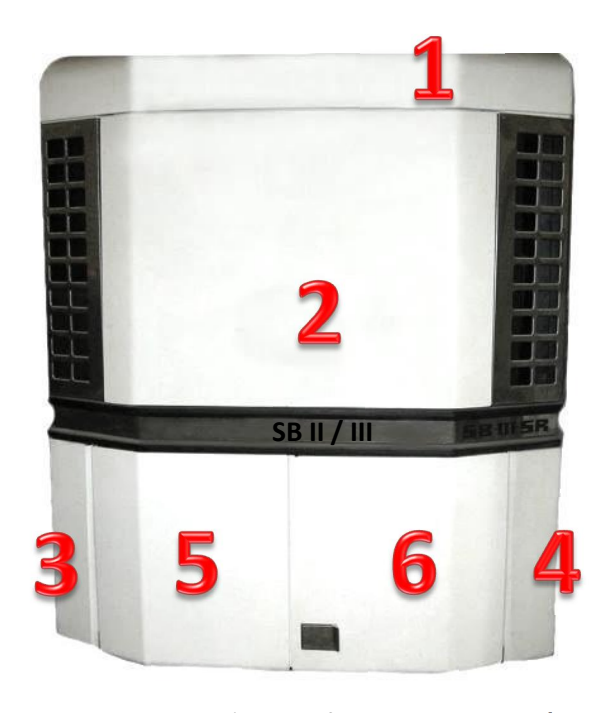
SB II/III Compatible Reefer Doors and Panels