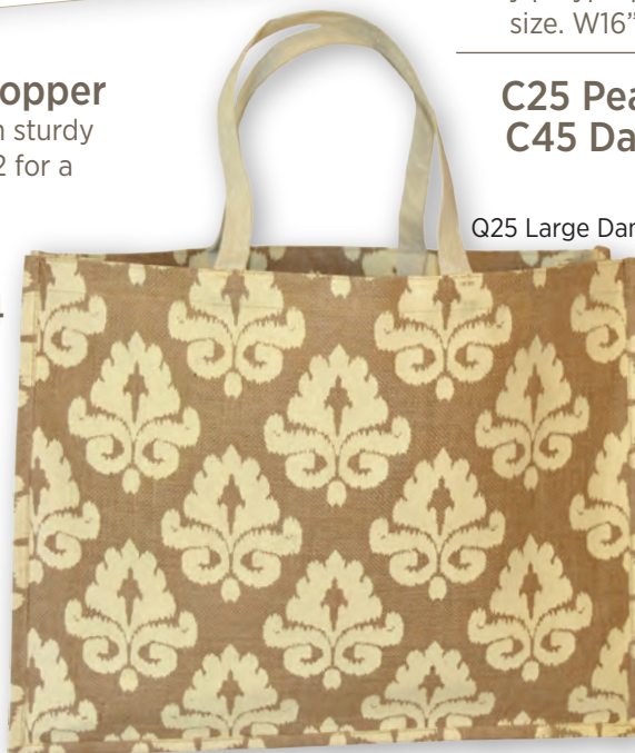
Q25 Large Damask