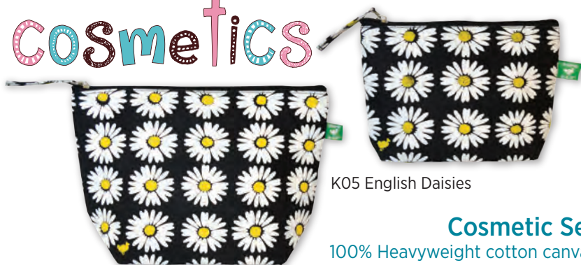
K05 English Daisies