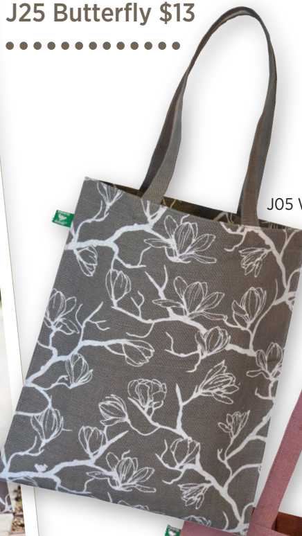
J05 Winter Branches