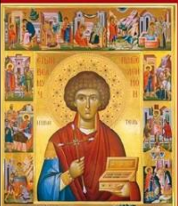
Gr. Martyr and Healer St. Panteleimon

Also we pray for peace and justice in Ukraine!