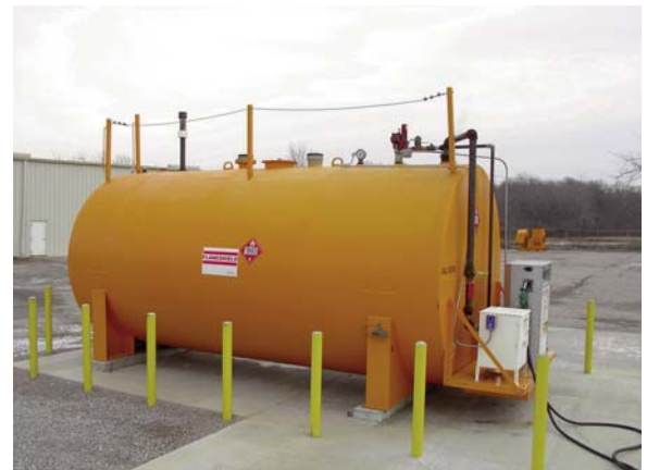
Compatible with a wide range of fuels and chemicals, including biodiesel and ethanol