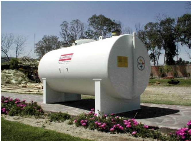
2-Hour 2000° fire-tested performance

FLAMESHIELD® aboveground storage tanks are manufactured with a tight-wrap double-wall design. Standard features include 2-hour fire-tested performance, built-in secondary containment and interstitial monitoring capability.