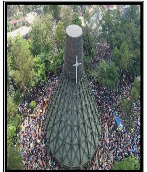
NAMUGONGO MARTYR SHRINE