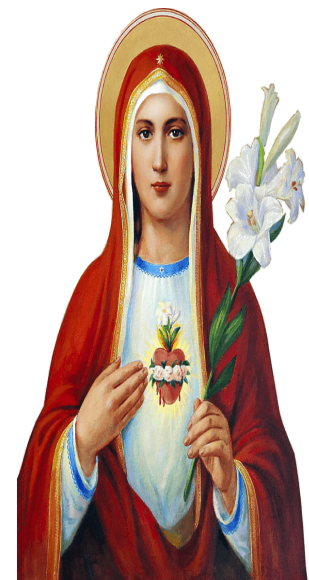
IMMACULATE HEART OF MARY