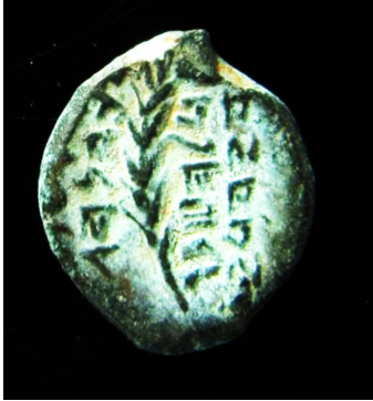
Hasmonean Palm Branch coin—John Hyrcanus

The Donkey was an historical flashback for