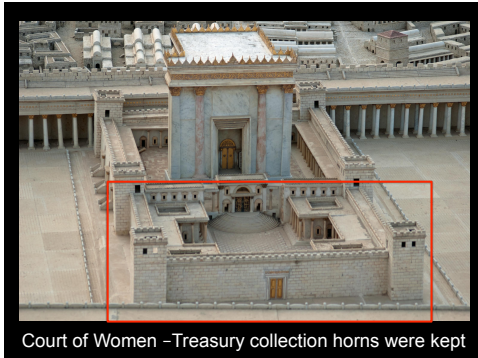
Court of Women –Treasury collection horns were kept