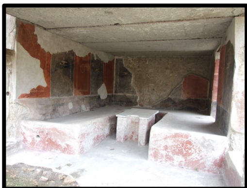
Triclinium table Pompeii

It's possible that Jesus was adhering to the "Essene" Solar Calendar which that year put Passover on Tuesday night-Wednesday.