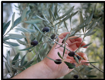
Olives on Mt of Olives