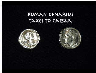
Roman denarius on left; dime on right

Teachers of the law and chief priests, aka THE POWERS