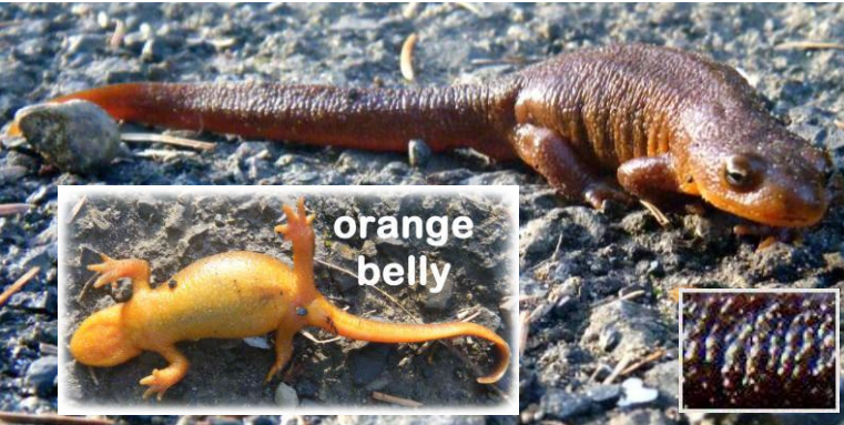
Rough-skinned Newt (poisonous skin, no scales)