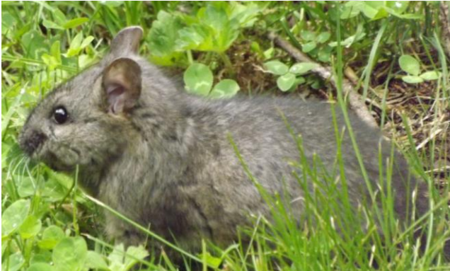
Bushytail Woodrat or "Packrat" (rat-sized)