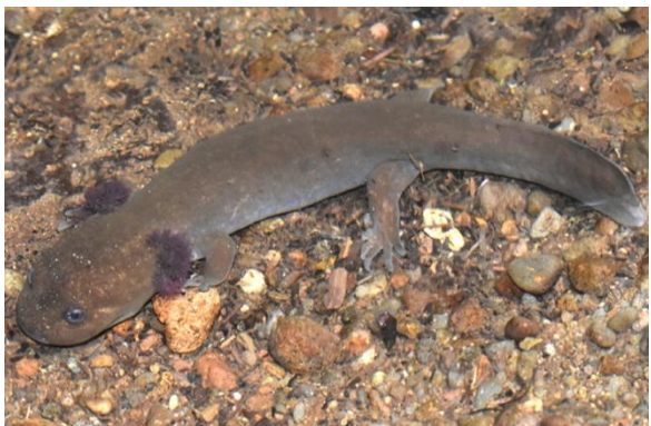
Coastal Giant Salamander