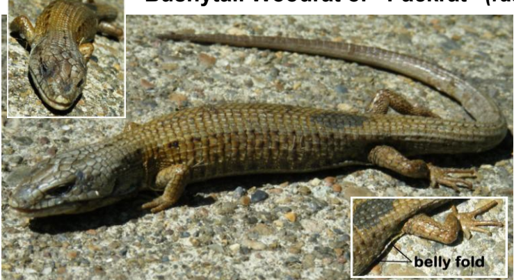
Northern Alligator Lizard (scaly)