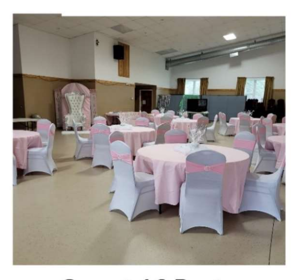
Sweet 16 Party