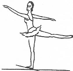
4. 2 nd