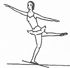
3. 4 th