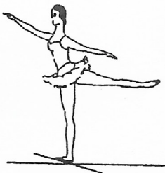
1. 1 st