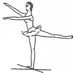
2. 3 rd