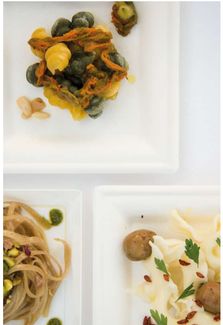
Pastapas dishes and recipes