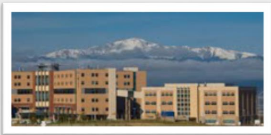
St. Francis Medical Center

Suggested Uses: Retail, Medical Office, Daycare, Restaurant, Industrial