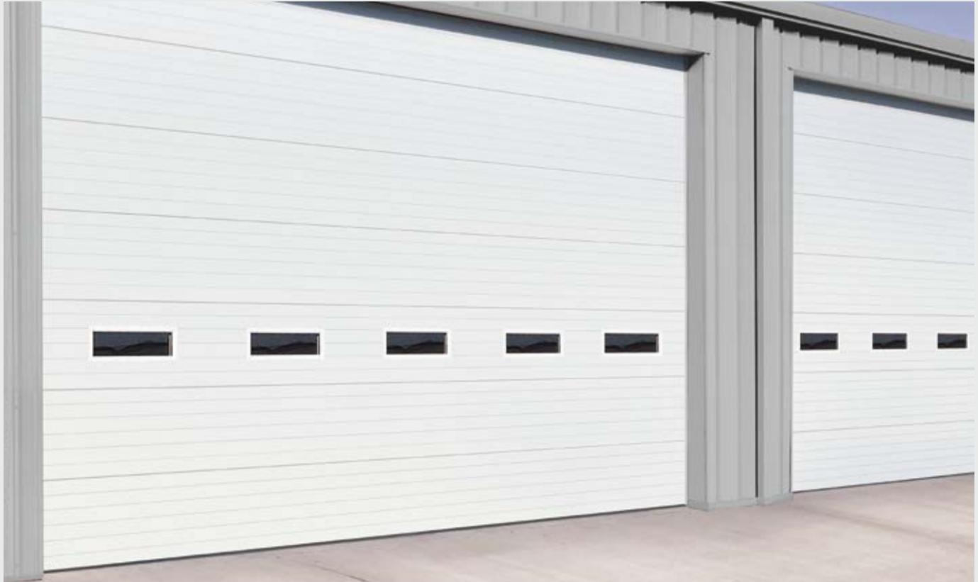
Model 3717, 16'2" x 14' doors, shown with 24" x 8" Lites