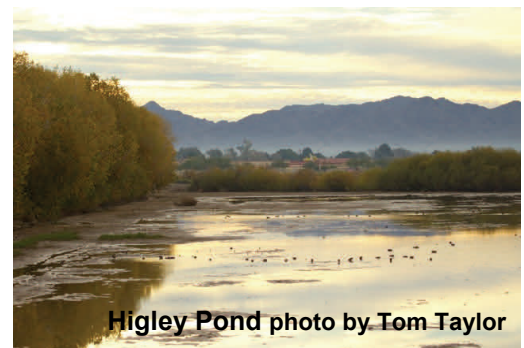
Higley Pond

Sunday morning we went to Higley Ponds where we had Pintails , Northern Shovelers , Gadwalls , Green-winged Teals , Song Sparrows , Ruby-crowned Kinglets , Yellow-rumped Warblers . Our next stop was Veteran's Oasis Park, where we saw our only Costa's Hummingbird , with a fantastic blue gorget, as well as immature Cooper's Hawk , Northern Harrier , Osprey , Antelope Jack Rabbit .