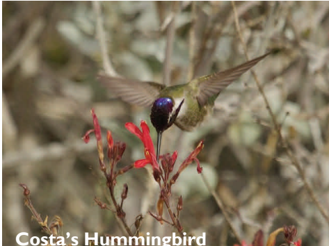
Costa's Hummingbird

January 15-18, 2016 Phoenix and Maricopa County