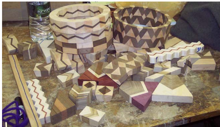
Extra rings and segmented pieces from the project. Wood is Maple, Walnut, and Bloodwood (?)