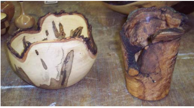
Larry Clay showed two natural edge bowls. On the left is one turned from Ambrosia Maple and on the right, a burl natural edge Beech.