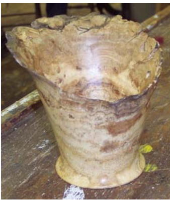
Jeff showed a natural edge thin Maple burl piece from Holly Hill Farm