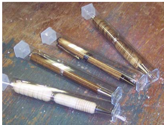
Four pens turned by Matt Collins- from lower to upper we have Birdseye Maple, Zebra wood straight cut, Teak and Zebra wood cross cut.