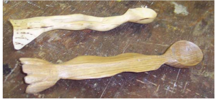
Wally showed us this rolled natural edge piece turned from Dogwood and two carved spoons