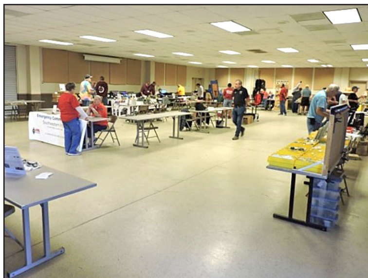
Doors open and slowly filling up.