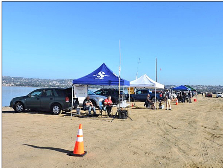
Off to the North are other Clubs and repeater groups. Food, other displays and agencies were to the South.