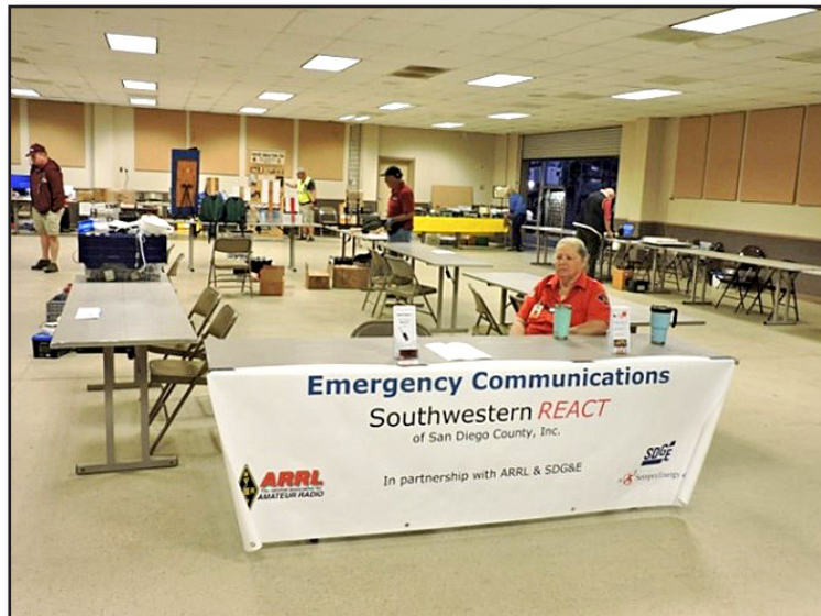
Ready for the doors to open.

most of our trifolds and had interest in REACT. Roger and I were there until 3:00 pm. The Lakeside Amateur Radio club furnished lunch for the vendors. It was a very nice day. ⚡