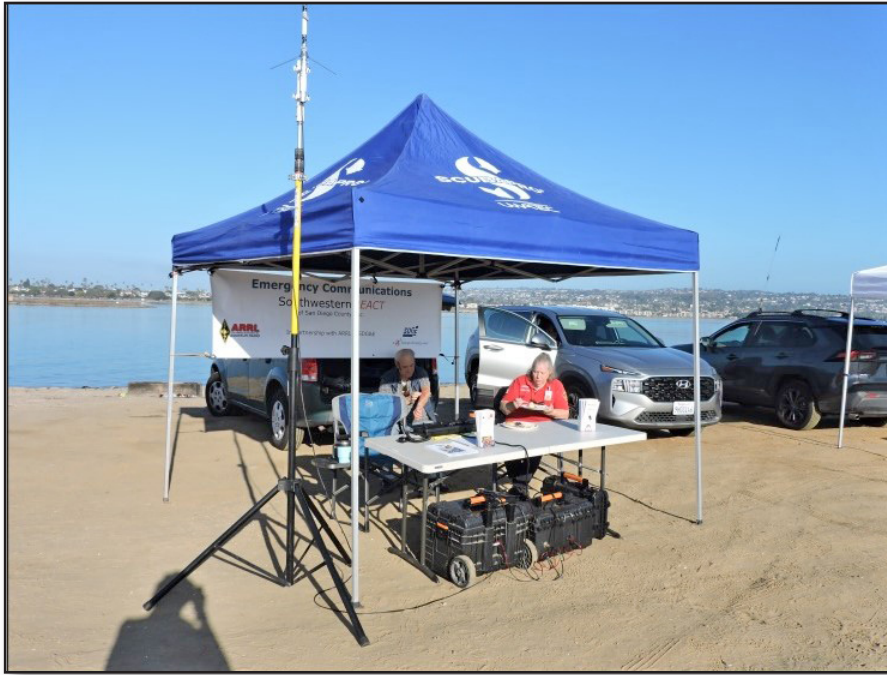
With the early morning sun in our eyes, we set up in the North half of Fiesta Island.