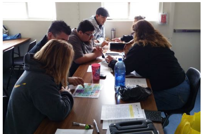
The staff from The Arc of Ventura County's A Street Program in Oxnard learn about communication systems