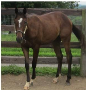
Romancing the Cat

There are over 67 stakes races scheduled annually by the New York Racing Association and Finger Lakes Racing Association exclusively for a registered New York bred. In addition, there are over 800 races written each year in the state covering a wide range of conditions for a registered New York bred.