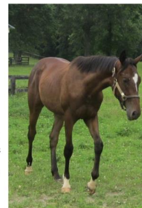
Romancing the Cat

The feeling of breeding and raising a foal to become a racehorse and stand with your horse in the Winner's Circle is overwhelming. The goal of Bergen Stables is to involve more fans in this exhilarating sport and witness the performance of these magnificent athletes!