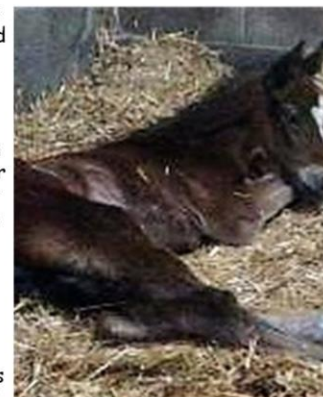
a few hours old

There exist no mark-up on the above expenses. Bergen Stables believes this will give partners a better opportunity for a positive return on their investment with us than with any other thoroughbred racing partnership in existence.