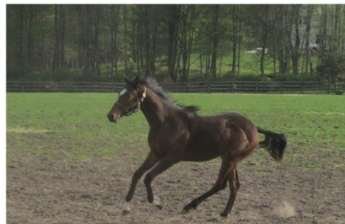
13 months old

Should the partnership be fortunate enough to have a stakes quality female horse, which is a filly or a mare, the opportunity to have a broodmare may exist. We can then sell or race her progeny, which is offspring, for many years to come!