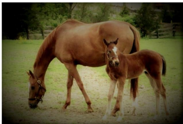
1-1/2 months old - with his Dam, Romanova