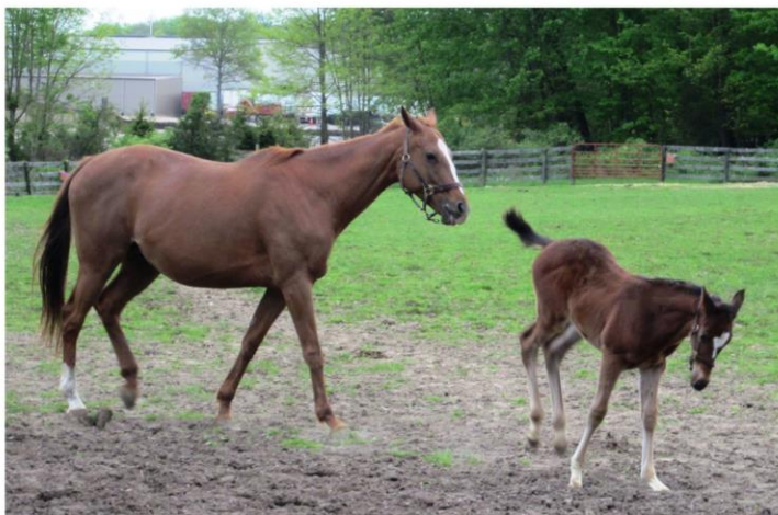
ROMANCING THE CAT, at two months old, playing with his Dam, Romanova.