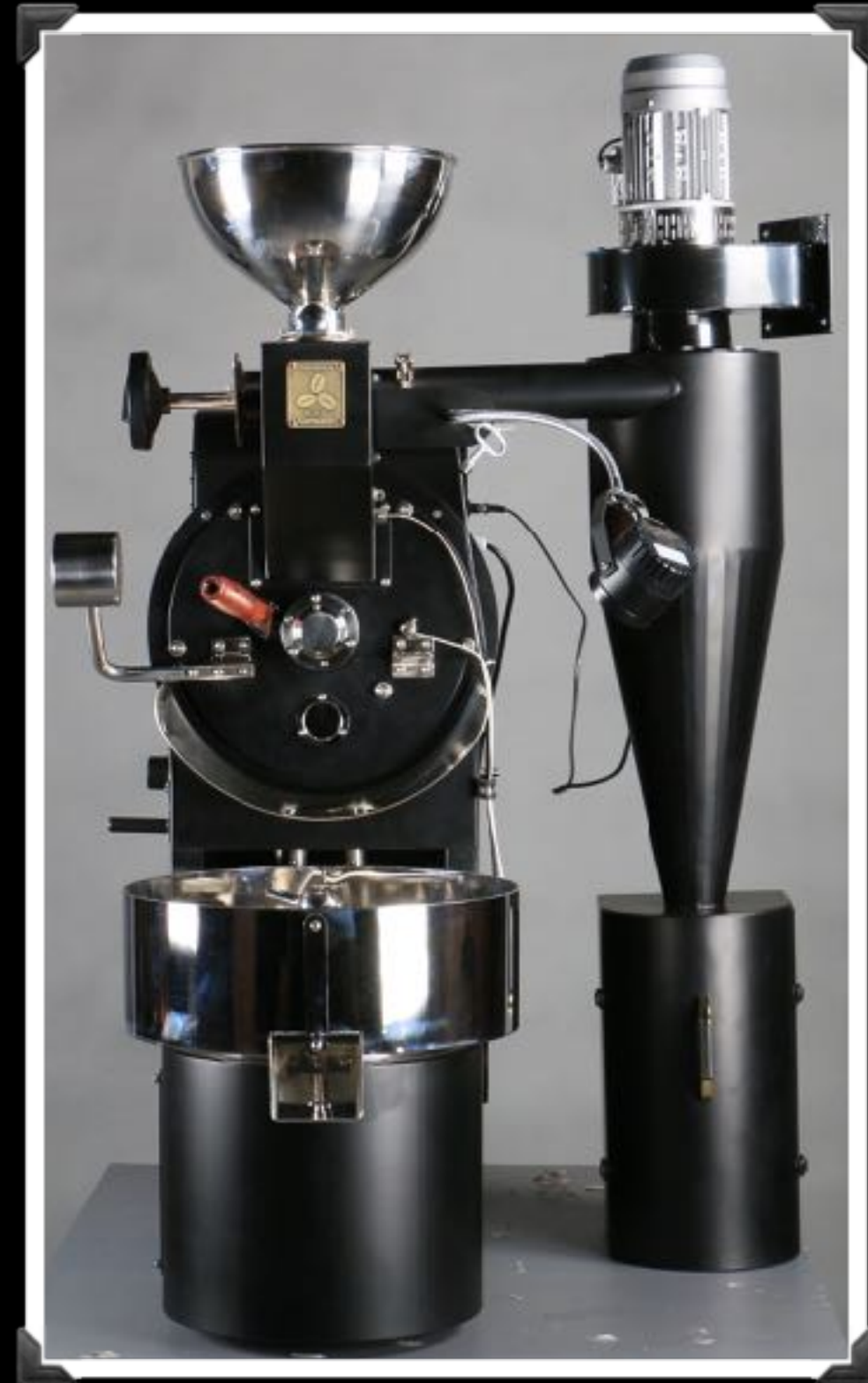
SEDONA ELITE 2000 DW