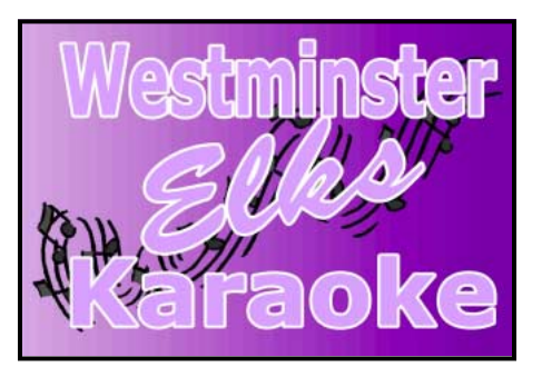
Dec. 6th & 20th 7:30 p.m. to 10:00 p.m.