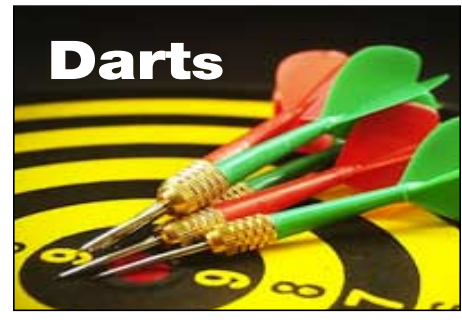
Every Thursday starting at 6:00 p.m.