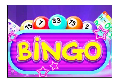
Dec. 4th & 18th 6:30 to 9:00 p.m.