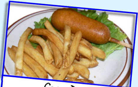
Corn Dog Served with steamed vegetables or French fries.

Order a sundae with lunch or dinner for .99¢