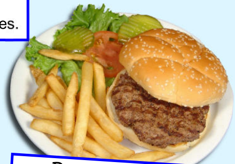
Burger Master A juicy burger served with French fries or steamed vegetables.