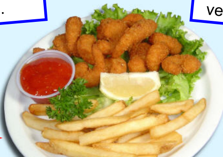
POPCORN SHRIMP Served with steamed vegetables or French fries.