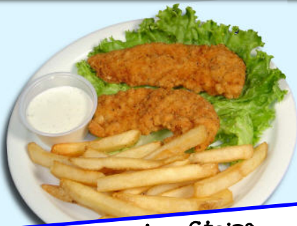
Chicken Strips 2 Strips served with French fries or steamed vegetables.