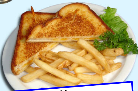
Say Cheese Grilled cheese sandwich served with French fries or steamed vegetables.