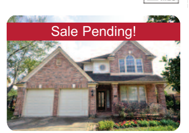
For sale Beautiful 4 bedroom, 3 bath. On the water. ML # 97515123 Owner/Agent