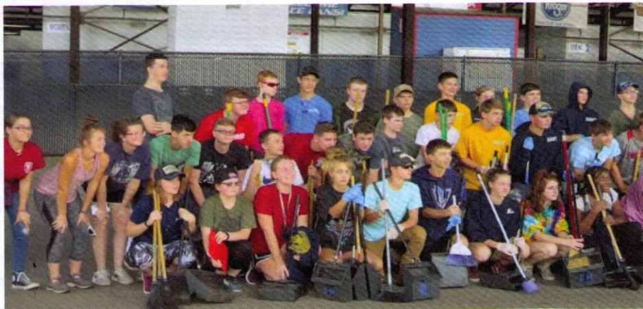
With brooms, mops, etc, Patrick Henry JROTC Cadets prepare to go to work

Early morning, Sunday September 22, two busloads of Patrick Henry High School JROTC cadets and their chaperones headed out to pick up trash in their assigned section of the stands at Richmond Raceway (RR). ✍