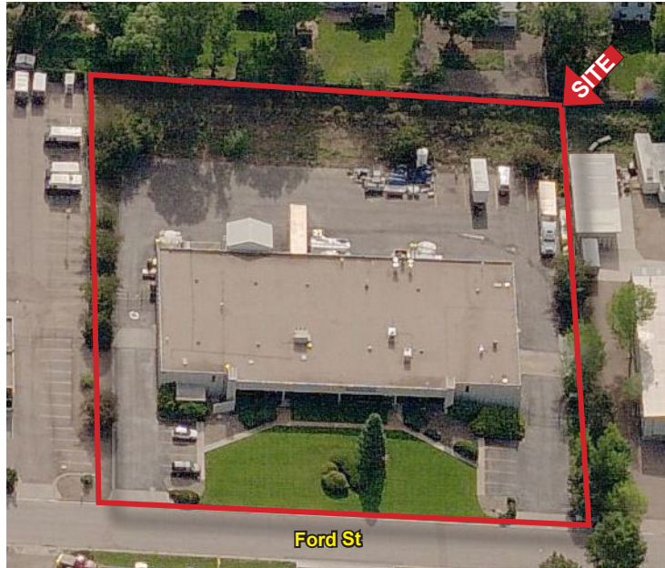
1335-1355 Ford Street