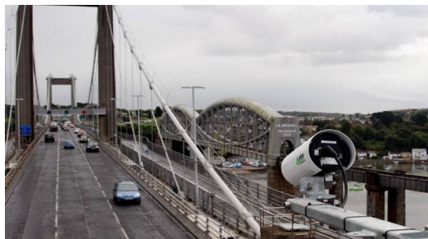
Fig.5: ALPR system installed on a bridge

ALPR system has wide ranged applications such as traffic surveillance for criminal detection, toll booth collection, parking management, distance travel management etc. The ANPR system for traffic surveillance could be installed on a bridge to track down the entire road way and record the motion of each and every vehicle. If a suspected vehicle is detected the proposed system looks for the entries in the database provided by the concerned authority such as local RTO to immediately find the details of the suspected person and inform the local police. In this way number of crime cases can be reduced by agreatextentandal so many such cases could be avoided in which the deriver runs off during an accident.