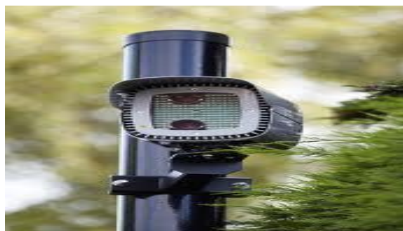
Fig.6: An ALPR system installed on a pole

ALPR system should be installed on tower on some height from where the entire glanceat the traffic could be made.