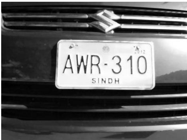
Fig.3: After Dilation of gray scale image.

We erode the image and apply median filtering technique after dilation of image, which is the basis of noise reduction or de-noising.