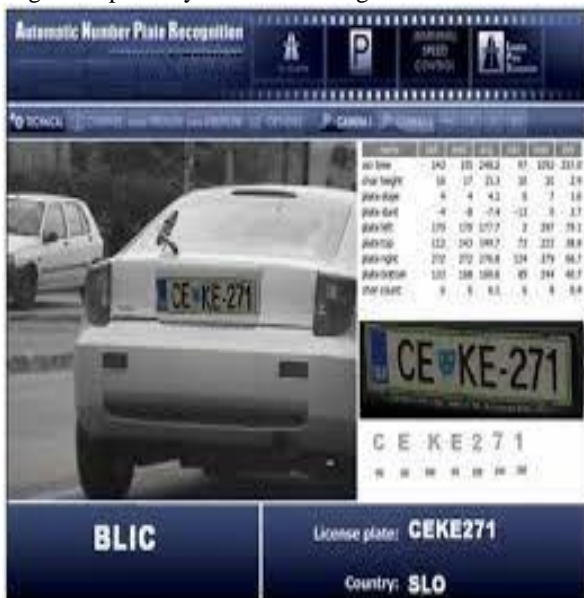
Fig.7: ALPR system recognizing the details of a car

The non-reflecting color of the characters and the vehicle's surface appear black. Direct sunlight enhances the infrared reflection, the LED array however is bright enough to recognize number plates in absolute darkness. The focal length of the infrared camera is adjusted to detect an overall width of one lane. The color camera with a lesser focal length generates images for overall view and alignment of the whole camera body. Both images are sent in intervals of 300ms to a Computer, where the installed software processes them. ANPR-systems can be either set up as shown in Figure 3 on a bridge construction over a carriageway or on the hard shoulder of a carriageway. In the latter case it is not possible to detect traffic on two lanes because the further lane will not be recognized optimally due to shadowing effects.