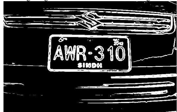
Fig.4: Convolution of the image for brightening the edges