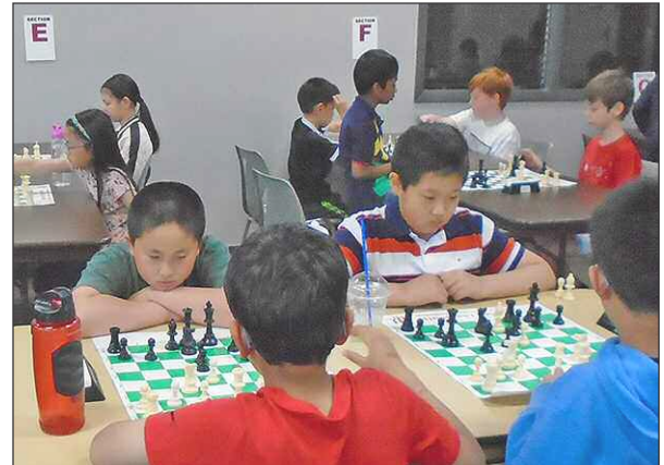
A variety of poses are held by players concentrating on their games.

Starting May 16, a five-week Wednesday evening (6:30 to 7:45) tournament is being held at the Greenfield Hall meeting room.