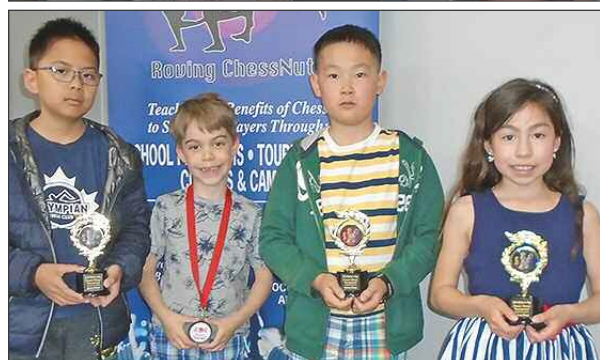
Watch for more photos from Mother's Day chess in the next issue of Chess Teasers