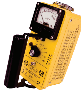
Model 3-IS-1 Part No. 48-3651