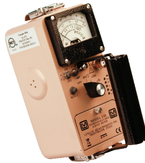
Model 3-IS Part No. 48-3581

The Model 3-IS series of intrinsically safe radiation survey meters are for use in areas where explosion hazard is a concern. The meter is available in two models. The general purpose Model 3-IS can be paired to any of several approved external radiation detectors (see list below) for exposure rate or contamination surveys. The Model 3-IS-1 gamma survey meter is outfitted with a single, internally mounted GM detector for performing exposure rate measurements. Rugged construction with separate battery compartment offers long-lasting protection and instrument life