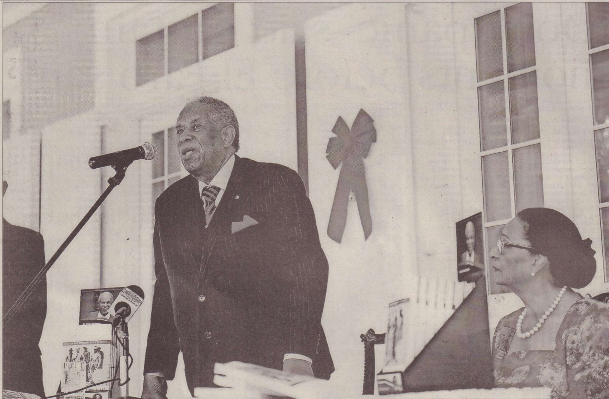
SIR ORVILLE TURNQUEST, former Governor General of The Bahamas, at the launch of his book, pictured below, at Government House.