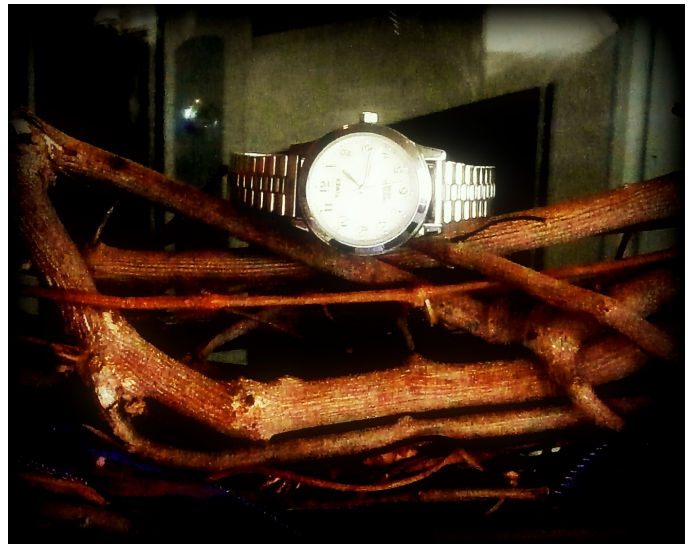
Photography Medium: 3rd Place - Kaleilyn Mulligan