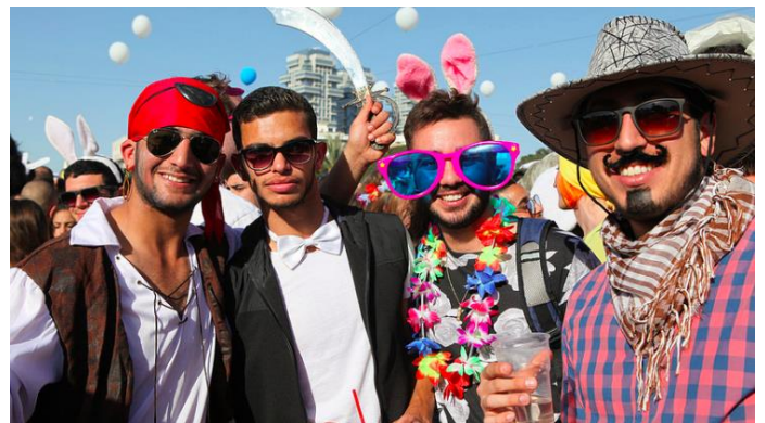
A Purim celebration in Israel

Purim reminds us that while we don't usually see 'sea splitting' miracles, there is a 'hidden hand' directing our experiences ensuring our lives play out according to the divine plan. While our world seems to be running on its own full of random unrelated events, it is God who hides behind the curtain of fate directing our experiences. To celebrate that, we hide ourselves by dressing up in costumes, appearing as something else, while our true selves remain hidden underneath the masquerade.