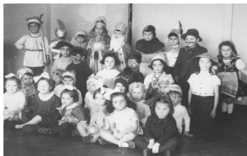
Purim in Europe prior to the holocaust