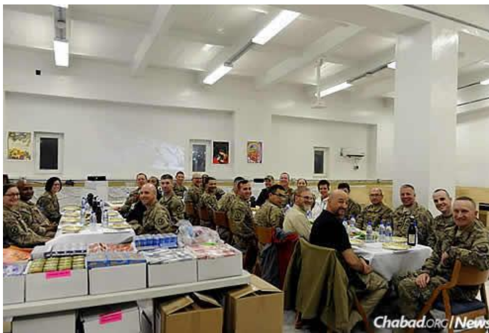
Pesach 5777 on the USS Nimitz