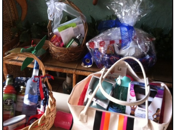
See the cute Elephant tea pot, or how about a bloody Mary with some Grey Goose!!

Yikes!! It's June already!! Our annual Fashion Show is in 2 weeks, and we are excited to share months of planning with all of you. So, before you go off on vacation, make sure you send your paid reservation before June 9. Final guest count to the Bali Hai is due on June 10. This venue and program is sure to bring out the patriotic spirit in all of us. Join us on Tuesday June 14***FLAG DAY*** to celebrate our "Stars and Stripes Forever." Here is a sneak peek of a few basket creations and donations from you lovely ladies. I promise you, these gift baskets will make you want to drop a ticket in every bag!!