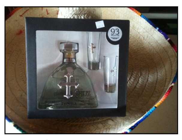
And here's some Cruz tequila to soothe those supporters still not on the TrumpTrain!!

BRING A FRIEND TO OUR FASHION SHOW ON JUNE