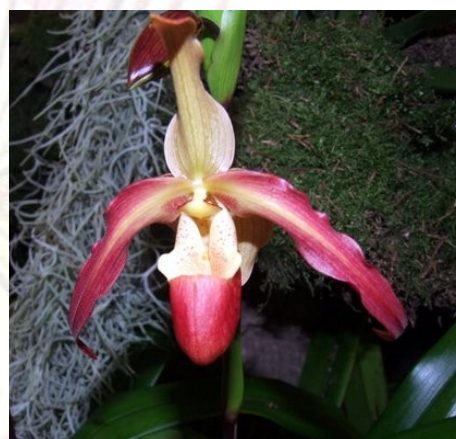
Phrag. Ruby Slipper

When the plant has finished flowering, it is beneficial to change the potting mix and check the root system of the plant. Phragmipediums enjoy being relatively pot bound. A potting media which retains high levels of moisture is preferable, such as sphagnum moss or Rockwool. The Rockwool is available in a number of forms developed for plants, but the cubes, either 1cm or 2cm depending on plant size are the most commonly used as they hold plenty of water but allow air gaps between each other. A top dressing of bark is recommended for the ease of ongoing care. The long petaled species are happier growing in a drier mix of bark and Perlite as used for Paphiopedilums,