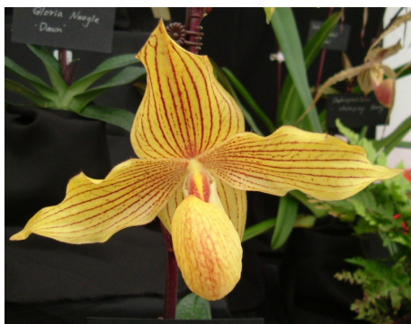
Phrag. Dollgoldi 'Golden Wings'

Approximately 18-22°C day-time temperature and 13-15°C night-time. The drop in temperature from day to night is an important part of the plants growing culture.