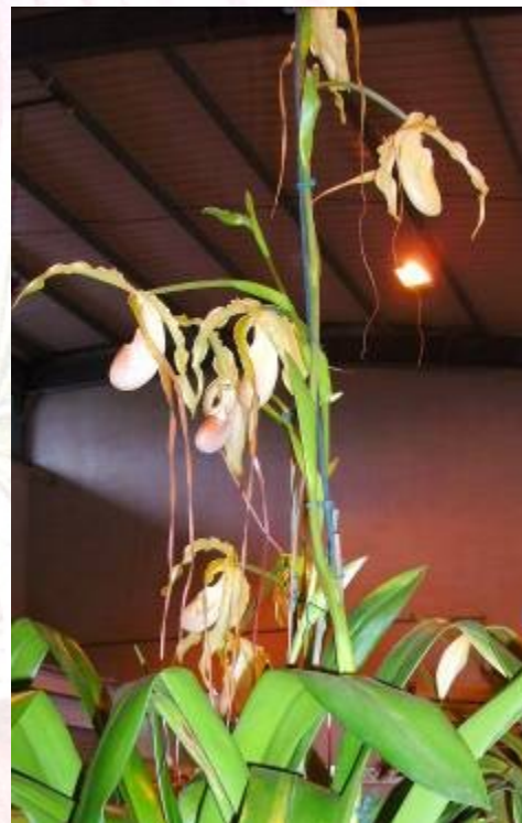
Phrag. Grande var. Microchilum

Phragmipedium ( frag-mee-PEE-dee-um ) another member of the slipper orchid family; these plants are native to South America and grow there in a tropical climate. Most of the species grow in moist conditions enjoying cool flowing water at their roots, although the exceptions to the rule are the long petaled types, caudatum and wallisii . The plants look similar to some of the strap leaf Paphiopedilum, forming a fan of leaves which produce a flower spike at their centre when mature. These spikes develop multiple flowers either on branching stems or consecutively. The number of widely accepted species is around 20 and from these a large number of hybrids have been developed. The pace of development increases each time a new species is discovered, offering a new attribute to use in the development of the Genus.