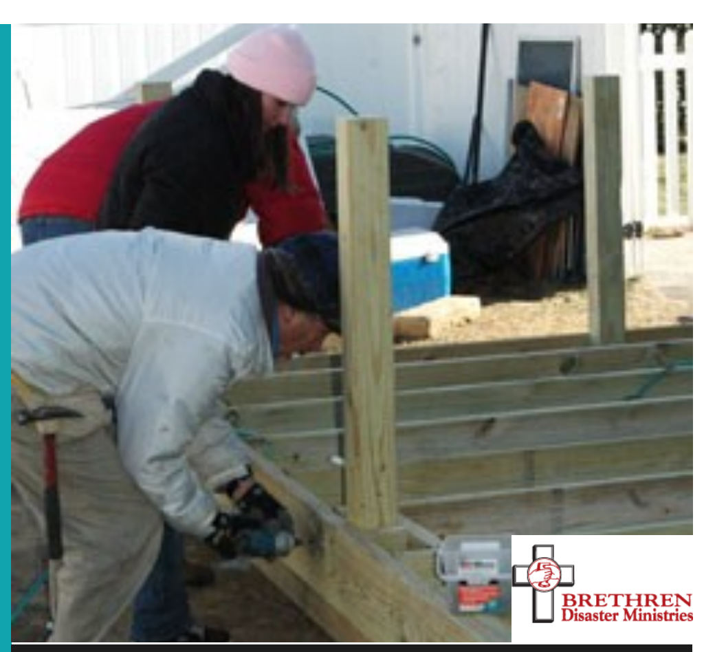
BDM Rebuild Project

Feb 16 8:00am Freezin' for a Reason Polar Plunge. Benefits Special Olympics. Center Lake Warsaw