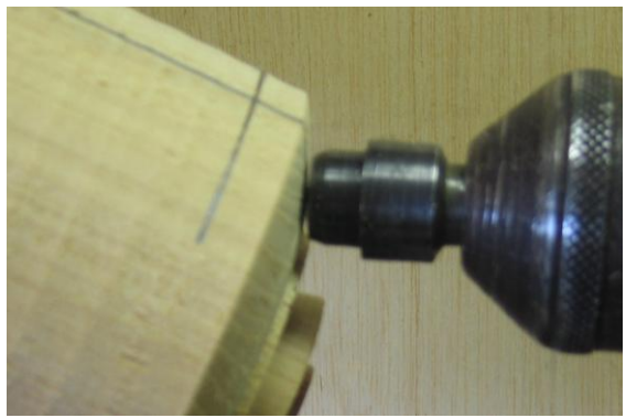
Fig 1 Fig 2