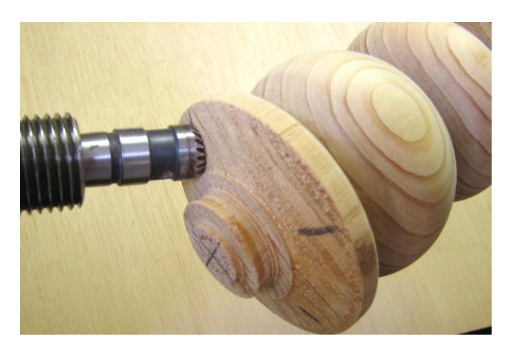
Drive center in contact with the bevel on the shoulder.

Safety first : Turning the second axis requires higher speed due to cutting a lot of air. A face shield is required for this part of the turning. You can now see why a tight fit on the lid is required. Selection of drive and tail stock center is also critical.