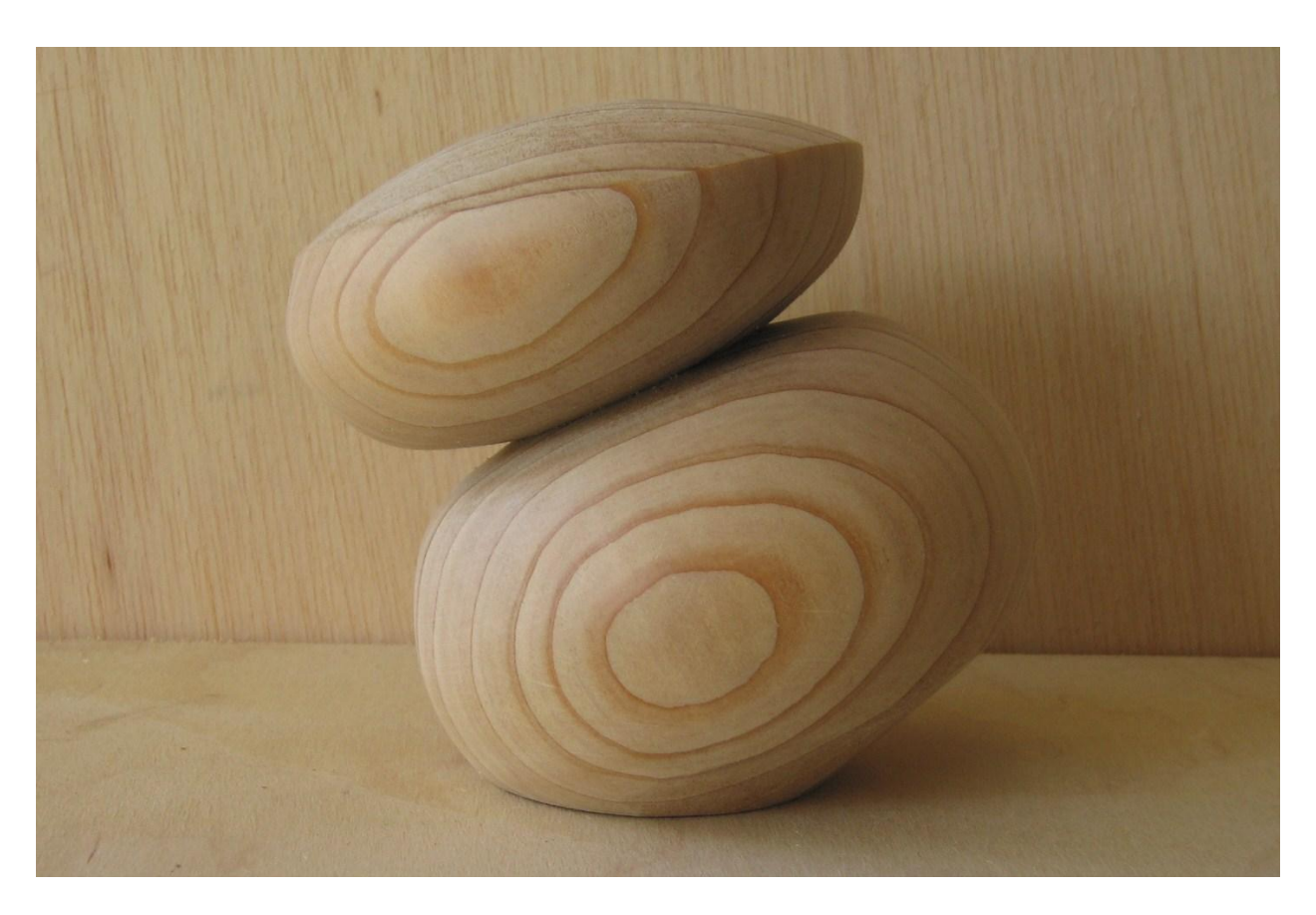
Finished box of Western Cedar