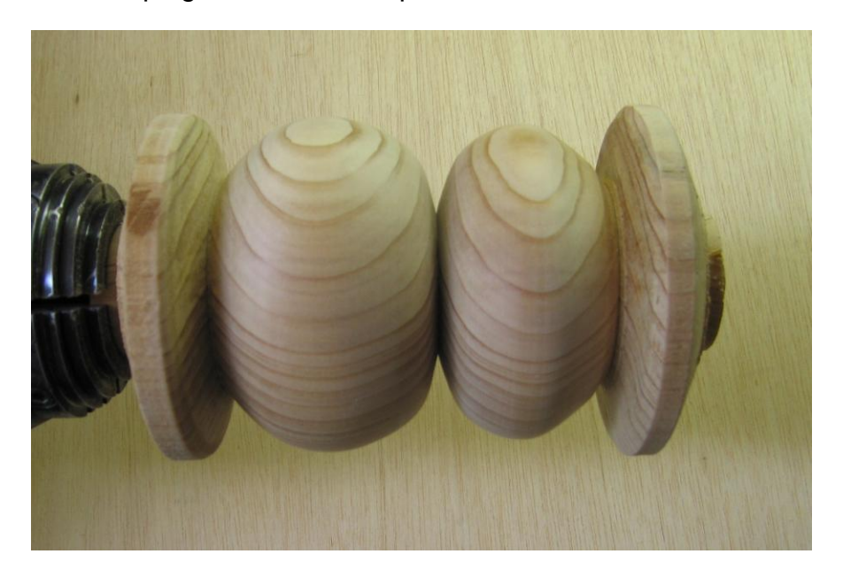
Finished box on first axis

This is the completed lidded box on the first axis. Remember to do all sanding when you have finished shaping the base and top. This is the last time for this finishing step.