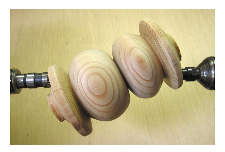
Second Axis mounted

Second Axis : Several options exist for placing the box on the second axis. Placement of the drive and tail stock will determine the shape of the final box. Rotation of the axis will determine the degree of final shape. Having the second axis in the same plane will produce one shape while rotating the axis will produce a different final shape.