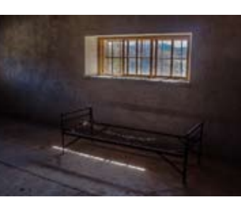
Empty Bed - 27 Tom Delaney