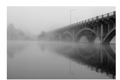
Lady's Birds Fog on Lamar - 27 Lynn White