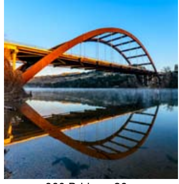
360 Bridge - 26 Frank Burdis