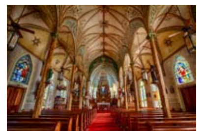
St Mary's - 27 Rose Epps