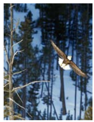
Soaring - Yellowston 26 - Paul Munch