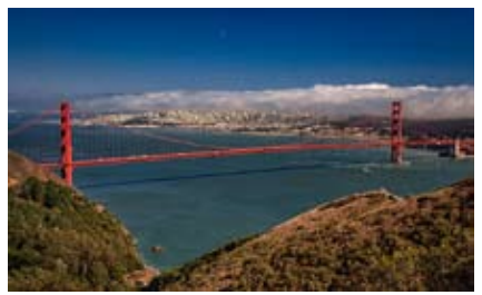
San Francisco Welsome - 27 Rose Epps