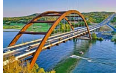
Pennybacker Bridge - 27 Kushal Bose