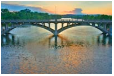
Lamar Bridge Twilight