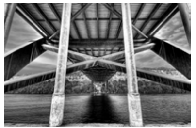
Pennybacker - 27 Phil Charlton