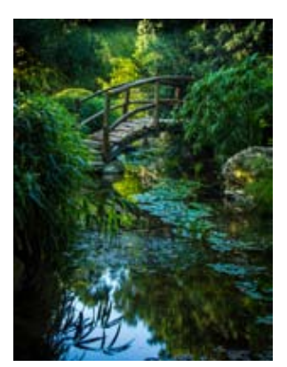
Zilker Bridge - 26 Tom Barton