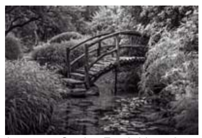
Japanese Garden Footbridge - 27 Kathy McCall