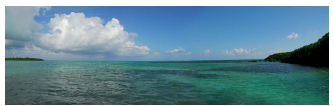
Vista towards the Meso-American Reef at Bacalar Chico [Mexican mangroves to the left, Belize to the right]