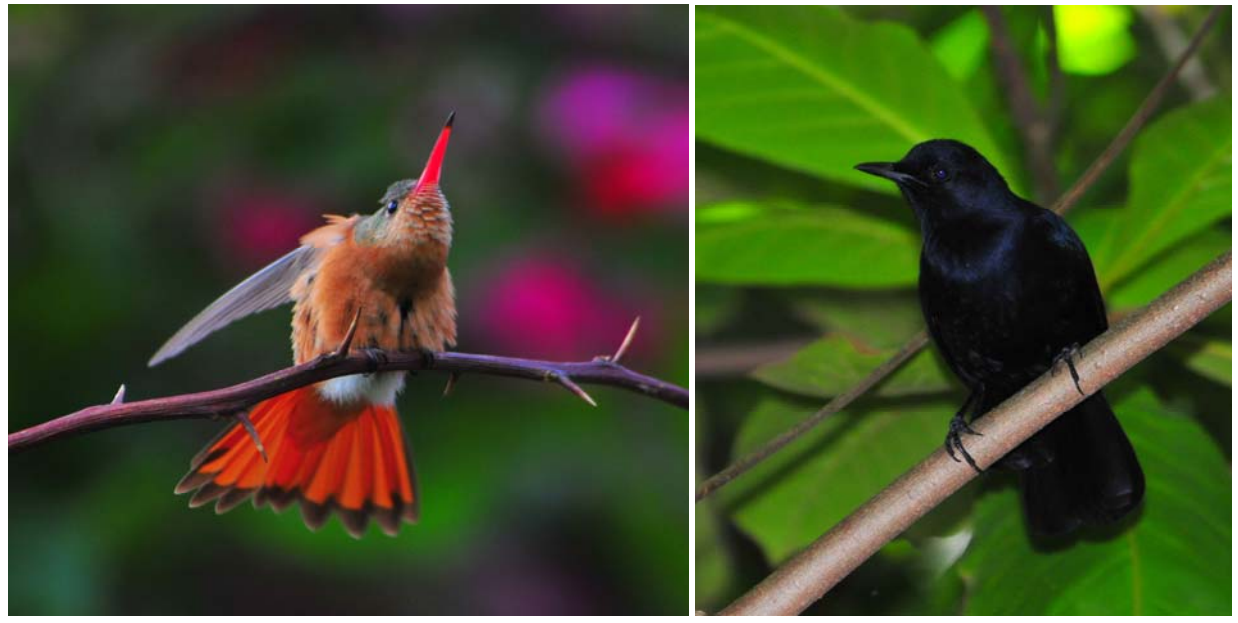
Cinnamon Hummingbird; Black Catbird [San Pedro]