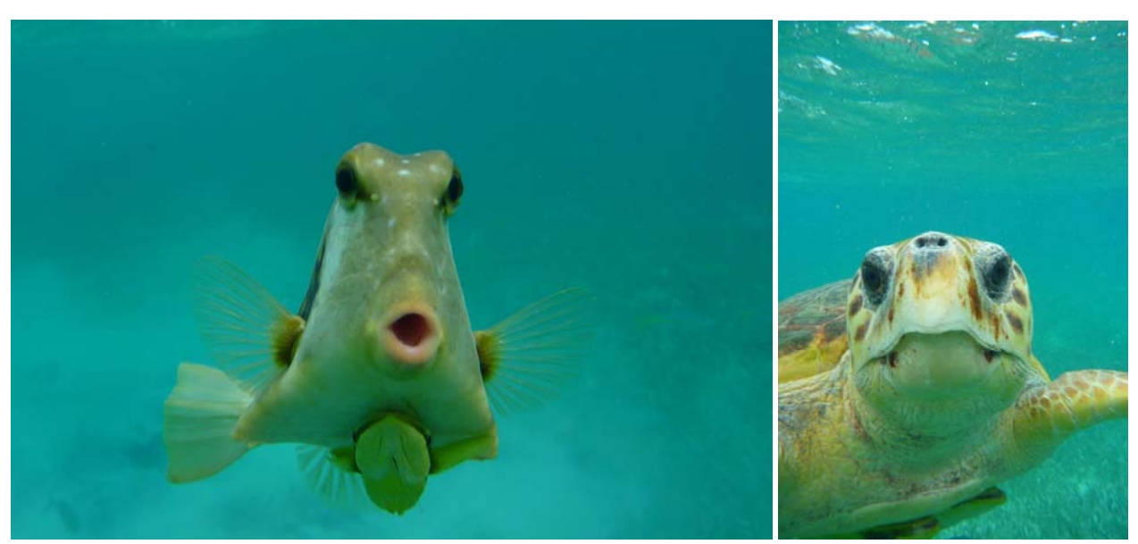
Want a kiss?; Loggerhead Turtle [Hol Chan Marine Reserve]