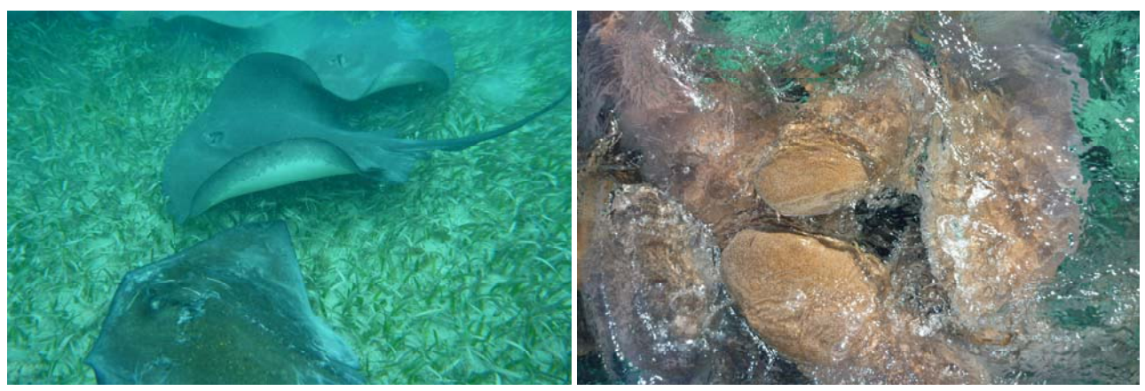
Southern Stingrays; Nurse Sharks [Hol Chan Marine Reserve]