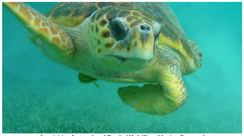
Inquisitive Loggerhead Turtle [Hol Chan Marine Reserve]