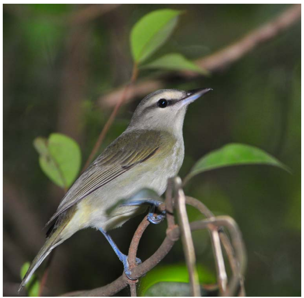
Yucatan Vireo [San Pedro]