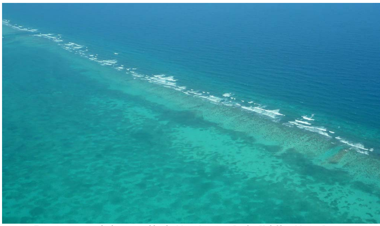
Extensive seagrass beds protected by the Meso-American Reef at Hol Chan Marine Reserve