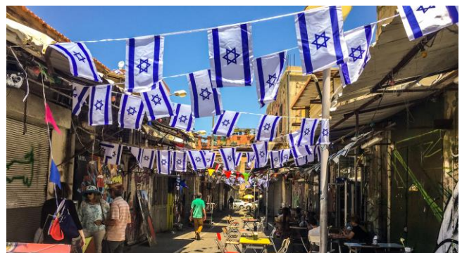
Israeli Independence Day (April 29) See p. 4 – An Item of Special Interest