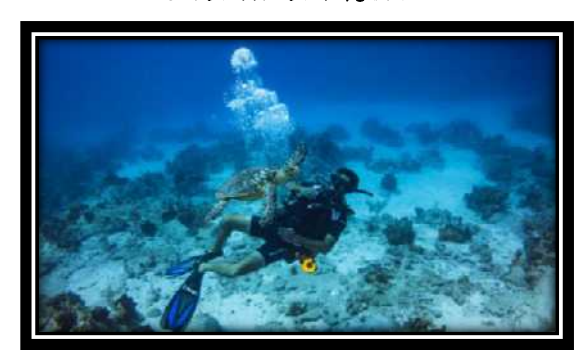
Dive the famous Bloody Bay Wall!