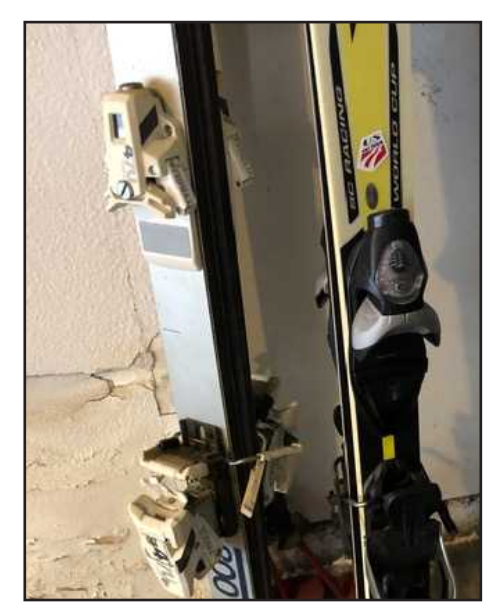
Contact Sigrid for ski clothing.