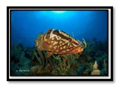
Enjoy the beautiful wildlife