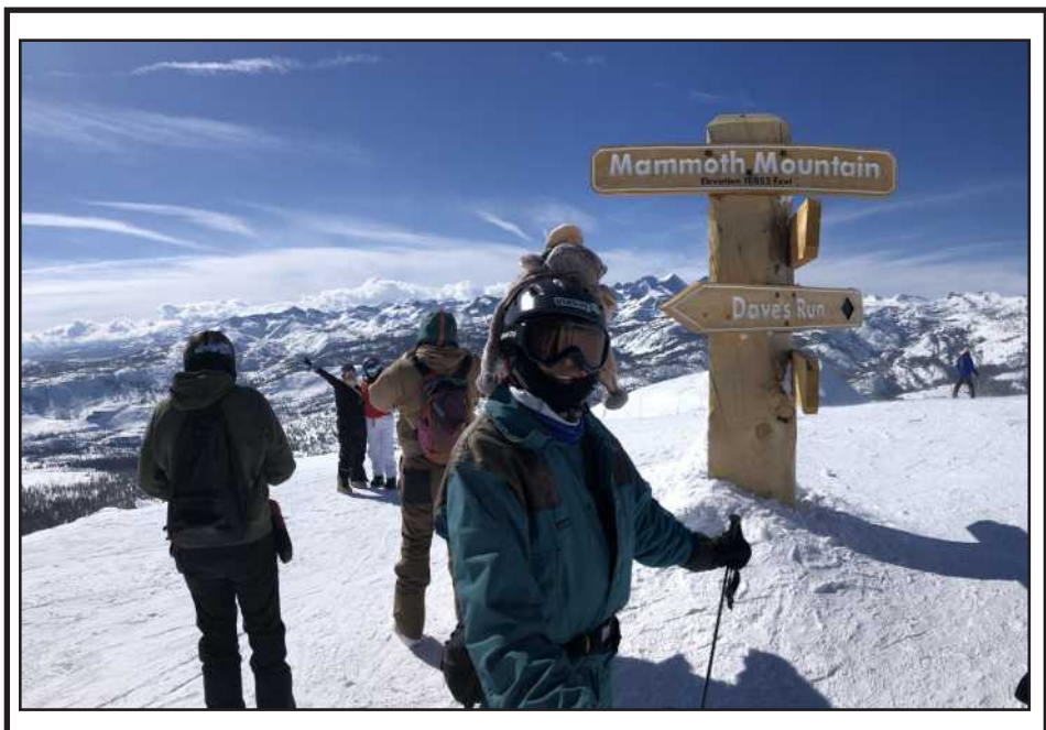
The Unrecables enjoy tons of snow at Mammoth in March.