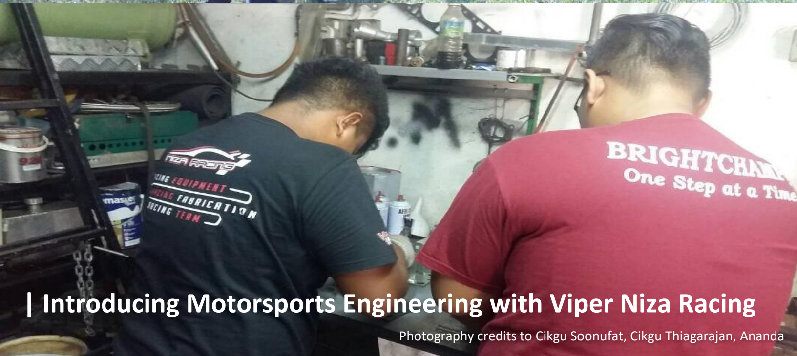
| Introducing Motorsports Engineering with Viper Niza Racing