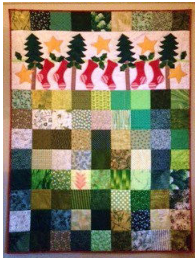
Quilter's Quest Shop Hop Quilt featured in the Quilted Heart Quilt Shop in Vacaville