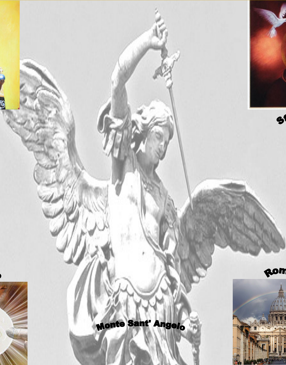
Monte Sant' Angelo