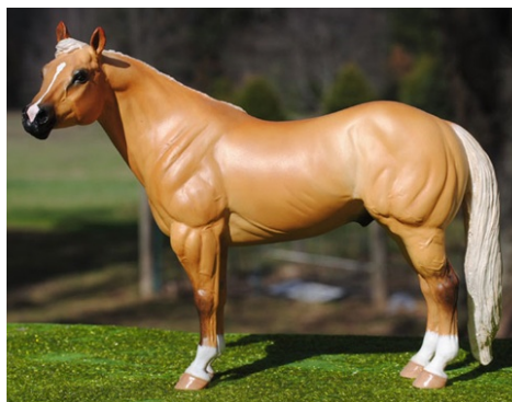
RES. CHAMPION FLOCKED/OTHER CUSTOM: SUPERBLY DUNN (SSu)