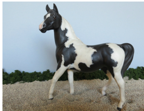
RES. CHAMPION LIGHT BREED: SOLAR QUEEN (CH)

Thoroughbred (5): 1-Winds Of Change (CH), 2-Flying Fare (CM), 3-Penny Arcade (BP), 4-Frostfang (KW), 5-Minstrel's Joy (APo)