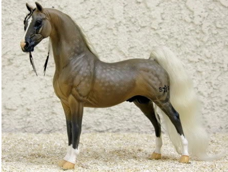
CHAMPION OTHER COLOR: 21ST CENTURY BOY (KM)