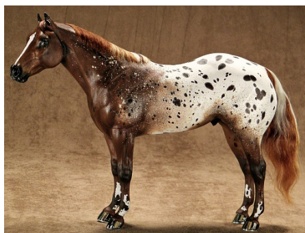
CHAMPION PATTERNED COLOR: IMA ROCK-A-TEER (CM)

Other Pinto Patterns (46): 1-Sparrow-ood Rob Roy (SSu), 2-Blackberry Lane Notorious (SR), 3-Plastique (SSu), 4-Footprint Princess Royal (KM), 5-South-ern Comfort (JG), 6-Power To Push (HC), 7-D's Hillbilly Hollywood (VM), 8-Never So Blue (JV), 9-Kentucky Buga-boo (SSu), 10-Looks Can Kill (RN), HM-Apache Lace (VM)