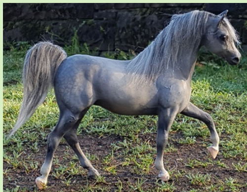
KT Der Wind 35 Years Old!