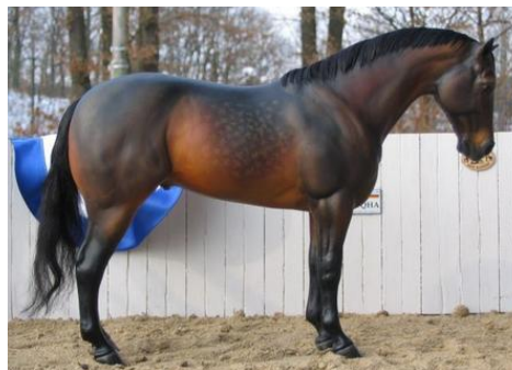
CHAMPION BASE COLOR: R. POCO LEO CHEX (SN)

Black (18): 1-PC Fergus (CM), 2-KT Moonlight Serenade (JG), 3-KA Flight of Fancy (JV), 4-TS Black Velvet (BH), 5-Zorro (JW), 6-Beltrane (SR), 7-Die Fledermaus (SSu), 8-Hawke Nevarre (BA), 9-Talula (SR), 10-Midnight's Mac (HC), HM-Katana (SN)