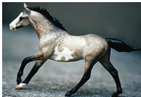
RES. CHAMPION REPAINT: BLACK-BERRY LANE NOTORIOUS (SR)

Repaint w/Hair M/T: Trad. or Larger (39): 1-GGK Tiqatu (SN), 2-Golden Malicious (SMB), 3-TS Galilean Dragoness (MP), 4-PR Eldorado Spanish Rose (JV), 5-TS Squall Line (MP), 6-TS Jalapeno (MP), 7-Buckthorn (SMB), 8-LBR Blue-Eyed Elaine (JG), 9-PR Wharram Percy (JV), 10-Brecon Apollo (KM), HM-TS Autumn Dancer (MP)