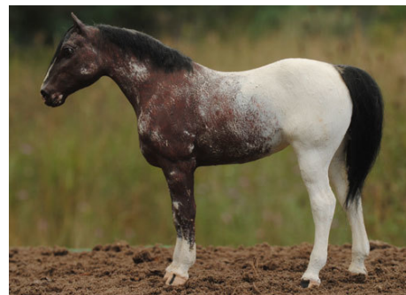
RESERVE CHAMPION REPAINT/HAIR OR SCULPTED M/T: CAYENNE'S CYETTE (SSu)

Simple Remake & Repaint w/Hair M/T: Trad. or Larger (6): 1-Nhi Vanye I Chyya (LB), 2-Cutter's Pokey Pine (CM), 3-Tejas Little Eagle (CM), 4-Diamond Red Hawk (CM), 5-Summer Breeze (SSu), 6-Polaris (SSSt)