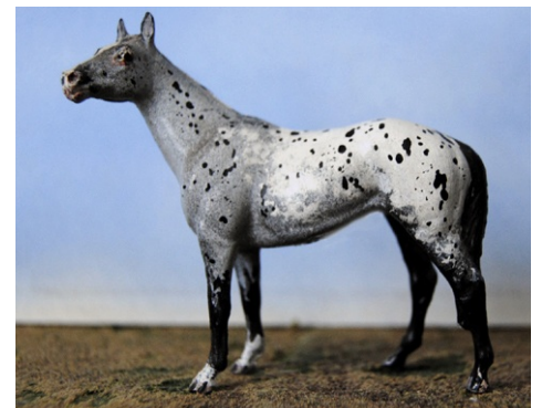
RESERVE CHAMPION SPORT BREED: WING'D JAGUAR (SSu)