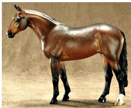
CHAMPION REPAINT: SOLID CITIZEN (CM)

Repaint: Smaller than Classic (31): 1-Blackberry Lane Notorious (SR), 2-Mc-Call's Blue Cat (KM), 3-Snookie (HC), 4-Captain's Flashy Jet (KM), 5-Jeral (SN), 6-HCF Galifrey (DC), 7-Blackberry Lane Sunlight Revel (SR), 8-HCF Black Watch (DC), 9-Fall Sunrise (HC), 10-Encaje (SSt), HM-Delta Don (HC)