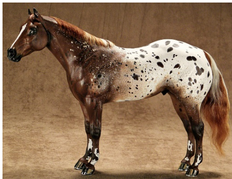
CHAMPION MAJOR REMAKE/REPAINT/HAIR OR SCULPTED MANE/ TAIL: IMA ROCK-A-TEER (CM)

Major Remake & Repaint with Non-Hair M/T: Smaller than Classic (1): 1-Wishful Thinking (KM)