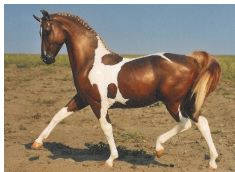
CHAMPION SPORT BREED: FLYING DUTCHMAN (JG)

Other Pure or Mixed Sport Breed (7): 1-Blank Stare (SR), 2-Ethereal Breezy V (BK), 3-Tug Hill By Design (CM), 4-Heartlight (HC), 5-Air Mail Special (APa), 6-After Thoughts (HC), 7-TS Fire On The Mountain (MP)