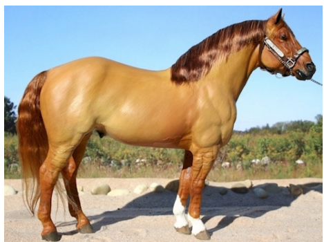
RES. CHAMPION CREAM/DUN COLOR: TS GRASSLAND SUNRISE (MP)

Blanket Appaloosa (34): 1-Ima Rock-a-teer (CM), 2-Bette B Badd (SSu), 3-Impressive Too (JG), 4-Gojaki (RN), 5-Impressive Heart (JG), 6-I'm Impressed (SN), 7-D's Stornaway Mister Blue (JV), 8-Kid Quannah (JG), 9-Heza Hobo (HC), 10-LBR Acadie (JG), HM-LBR Doc Sam-pedro (JG)