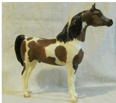
RESERVE CHAMPION CUSTOM WITH FACTORY PAINT: DOUBLE TAKE (MT)

Repaint: Traditional or Larger (20): 1-Kentucky Bugaboo (SSu), 2-Poco Skybar (RN), 3-Mystic Pumpkin (HC), 4-Sparkling Chablis Z (CM), 5-Llaqtaymanta (SN), 6-Mr. Hanky Panky (LB), 7-Pearl Essence (CM), 8-Rummikub (JB), 9-Shine On Harvest Moon (APa), 10-Oh Baby! (APa), HM-Come Fly With Me (CC)