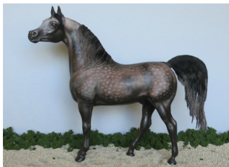
CHAMPION MAJOR REMAKE/RE- PAINT/HAIR OR SCULPTED MANE/ TAIL: *THE RAISULI (CH)

Major Remake & Repaint w/Hair M/T: Smaller than Classic and Major Remake & Repaint w/Non-Hair M/T: Classic and Smaller than Classic: none