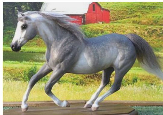
DIAMOND HANDSOME DEVIL