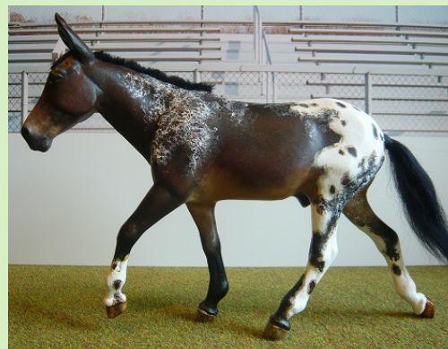
DA Bardigano Honest John 20 Years Old!

(Have one created in 1960, 1965, 1970, 1975, 1980, 1985, 1990, or 1995? Get it into the Birthday Barn spotlight by e-mailing its photo and info to our Gmail address below!)