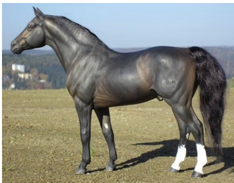
RES. CHAMPION SIMPLE REMAKE/REPAINT/HAIR OR SCULPTED MANE/ TAIL: AMANTUS VS (SN)

Major Remake & Repaint w/Hair Mane/ Tail: Trad. or Larger (82): 1-Ima Rock-a-teer (CM), 2-D.O. Sportin' Chance (BH), 3-Willie's Wyld Fire (RN), 4-Sparrowood Rob Roy (SSu), 5-Plastique (SSu), 6-RAS Elian Demoiselle (CM), 7-Hathor (SN), 8-Cutacross Shorty (SSu), 9-The Devil's Advo-