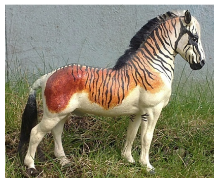
RES. CHAMPION OTHER COLOR: QUAGGA (JG)

1990s COLOR DIVISION OVERALL CHAMP: IMA ROCK-A-TEER (CM)