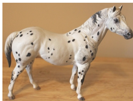
CHAMPION REPAINT: BROTHER LOVE (LB)

Repaint: Smaller than Classic Size (4): 1-Wing'd Jaguar (SSu), 2-Winds Of Change (CH), 3-Pick Me A Winner (APa), 4-Rihanna (APo)