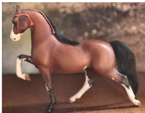
CHAMPION GAITED BREED: FLIP THE SWITCH (HC)

Other Pure or Mixed Gaited Breed (2): 1-Mr. Majestic (SSSt), 2-Taxi Dancer (SSu)