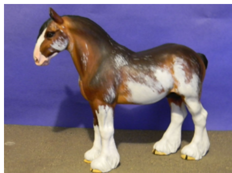
CHAMPION REPAINT: CEDAR HILL DUNCAN (VM)

Repaint: Smaller than Classic (8): 1-Charisma (CC), 2-DQ Jim Dandy (SSu), 3-Tanzer (CH), 4-En Fuego (CR), 5-Khrystal Music (CH), 6-Dexi's Midnight Runner (SSu), 7-Ravyn (SSu), 8-Rockin' Jade (HC)