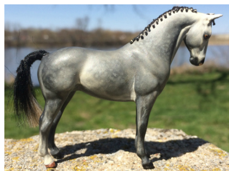
RESERVE CHAMPION SPORT BREED: PHANTOM WOLF (SR)

Paso Fino/Peruvian Paso (6): 1-Encantador (CM), 2-Diamond Majestad (CM), 3-Mago CDM (KM), 4-Trueno Azul (CM),