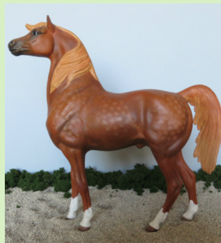
Sheneyn Alar 45 Years Old!