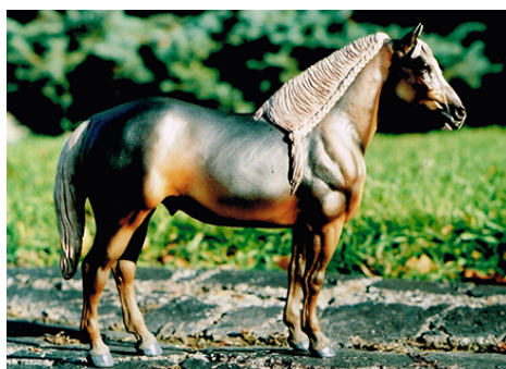
RESERVE CHAMPION SPORT BREED: BLAZE OF GLORY (APa)

Paso Fino/Peruvian Paso (9): 1-Huari-canga (KW), 2-LJ Abricotine Bleu (JV), 3-Marquesa (CM), 4-TS Jalapeno (MP), 5-TS Crystal Conchita (MP), 6-PR Balenciaga Brio (JV), 7-Lad Amigo (HC), 8-Raven (HC), 9-Tesoro D Oro (JW)