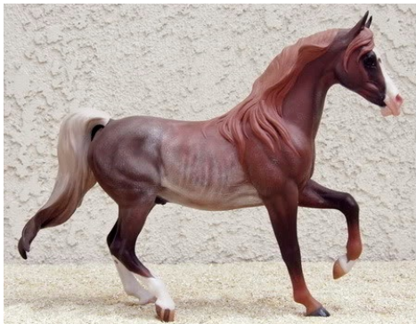
CHAMPION SIMPLE REMAKE/REPAINT/ HAIR OR SCULPTED MANE/ TAIL: LJJ ROYAL FIRE (KM)

Simple Remake & Repaint with Non-Hair Mane/Tail: Smaller than Classic (4): 1-Ziggy (HC), 2-Skip Mount (RN), 3-Autumn Storm (HC), 4-Marlayna (SR)