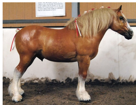
RESERVE CHAMPION DRAFT BREED: BILLFAR DU MARAIS (SSu)

American Pony (15): 1-21st Century Boy (KM), 2-Zip's Silver Lining (CM), 3-Confederate Gray (LB), 4-DQ Starsparkle (APo), 5-Paradox (SW), 6-BBG's Silver Ghost (CM), 7-DQ Butterscotch Brandy (APo), 8-Marshall Cody (LB), 9-The Paisley Palette (SR), 10-Zip's Diamond Jim (CM), HM-Empire's Fudge Sundae (CM)