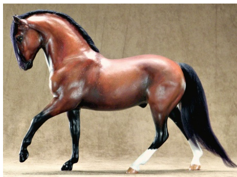
RESERVE CHAMPION SPANISH BREED: CAPRICHOSO (CM)

ASB (13): 1-Dark Commander (CH), 2-Business As Usual (HC), 3-Love N' Flames (CH), 4-Grey Mercedes (SSu), 5-Sir Arthur (HC), 6-LL Tidal Wave (SMB), 7-Manchester Memory (JW), 8-Diamond Sungold (APo), 9-Highland Heartbreaker (SSu), 10-Sundae Best (HC), HM-DQ Spicy Stepper (SSSt)