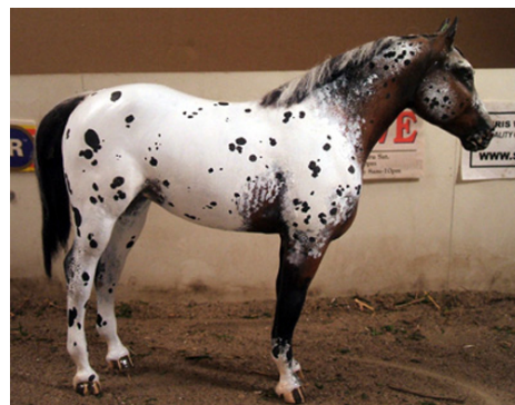
RESERVE CHAMPION PATTERNED COLOR: CLASSY LOVE (SSu)

Longear/Exotic (8): 1-Imagine That (SR), 2-Gentleman John (BH), 3-Gallimaufry (SSu), 4-Ironwood Glenn (SSt), 5-So Molson Canadien (SSu), 6-Bob