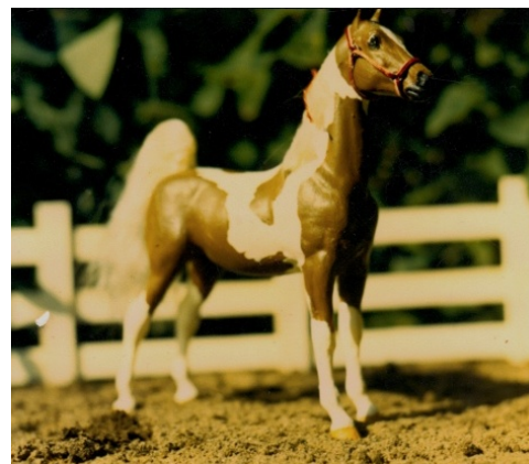
Model Horse Scenes

Foals (2): 1-Eye Twinkler (NF) [pictured at top of next column], 2-My Name Is Michael (SS)