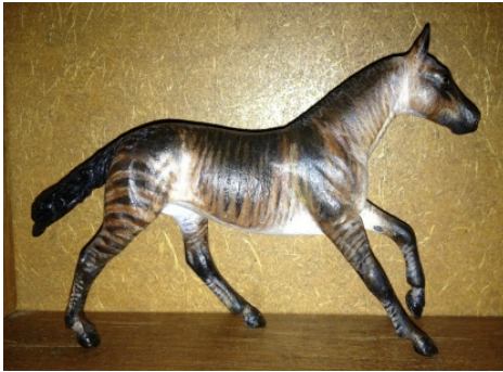
RESERVE CHAMPION OTHER COLOR: IMAGINE THAT (SR)

1980s COLOR DIVISION OVERALL CHAMPION: SMOKE BAR SYNDICATE (CC)