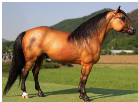
CHAMPION CREAM/DUN COLOR: BUCKTHORN (SMB)

Dun/Grulla (12): 1-TS Grassland Sunrise (MP), 2-Jemez Antigua (SR), 3-Rob Roy (KW), 4-Mo' Better Blues (JV), 5-LBR Docs Rusty Conchita (JG), 6-Ragnar Lothbrok (KW), 7-Mellyna (JG), 8-LBR Treisty (JG), 9-Dun Stormin' (JV), 10-Butterfly Kiss (JV), HM-Tora Tora Tora (HC)