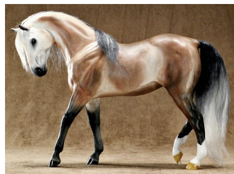
RES. CHAMPION SPANISH BREED: MALEGENA (CM)

American Saddlebred (17): 1-Capital Genius (HC), 2-Marvelous Marvin (HC), 3-HCF Black Watch (DC), 4-Fall Sunrise (HC), 5-TS Autumn Dancer (MP), 6-MN Jackie O (HC), 7-Highland's Captain Jack (NF), 8-Crown Royale (BA), 9-Autumn Storm (HC), 10-TS Equinox (MP), HM-Keepsake (HC)