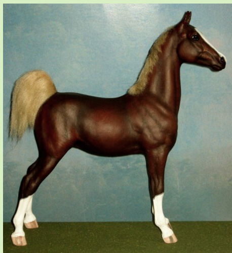
Foxy's Image 30 Years Old!