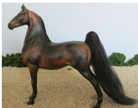
RESERVE CHAMPION GAITED BREED: DARK COMMANDER (CH)

Clydesdale/Shire (10): 1-Cedar Hill Duncan (VM), 2-Belle (HC), 3-Sparrowwood Beauty (SSu), 4-Dominion Blue Douglas (SSu), 5-Lady Of Trieste (CM), 6-Northrigg Sable (VM), 7-Castlekeep Mistress (LB), 8-Diamond Blue Rose (CR), 9-Royal Witch (APo), 10-Budweiser's Pride (MT)