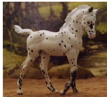
RES. CHAMPION FLOCKED/OTHER CUSTOM: RICATEZ (APo)

1960s/1970s WORKMANSHIP DIV. OVERALL CHAMPION: BROTHER LOVE (LB)