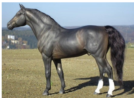
CHAMPION SPORT BREED: PR AMANTUS VS (SN)

1-Solid Citizen (CM), 2-PR Murphy Brown (JV), 3-PR Rosie O'Grady (JV), 4-I'm Impressed (SN), 5-Parklane Oystercatcher (JV), 6-Fiesta Time (SSt), 7-PR Wharram Percy (JV), 8-Kamtara Colorado Autumn (JV), 9-Mr Darcy (SN), 10-Au Chocolat (APa), HM-CL Thunder Rolls (HC)