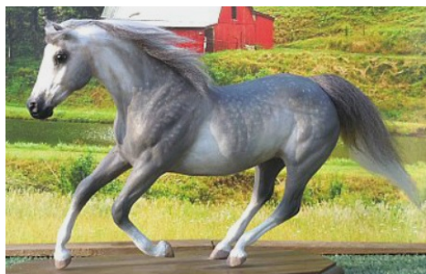
CHAMPION EXTREME REMAKE/RE- PAINT/HAIR OR SCULPTED M/T: DIAMOND HANDSOME DEVIL (BH)

Extreme Remake & Repaint w/Non- Hair M/T: Classic and Smaller than Classic: no entries