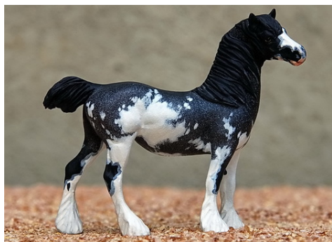
RES. CHAMPION EXTREME REMAKE/REPAINT/HAIR OR SCULPTED M/T: FOOTPRINT PRINCESS ROYAL (KM)

Flocked w/Flocked M/T and Remade & Flocked w/Flocked M/T: no entries