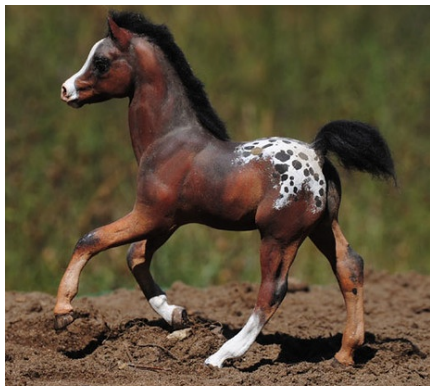
CHAMPION FOAL: BETTE B BADD (SSu)

Longear/Exotic/Fantasy Foal (9): 1-Beakman (SSu), 2-Waltzing Matilda II (HC), 3-Harry (HC), 4-Miss Moody (HC), 5-Jewels (HC), 6-Grits (BH), 7-Roberto (BA), 8-Jose (BA), 9-Samuel (BA)