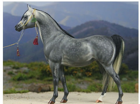
CHAMPION REPAINT/HAIR OR SCULPTED MANE/TAIL: MON'NAFA RANI (CR)

Repaint with Non-Hair Mane/Tail: Smaller than Classic: no entries