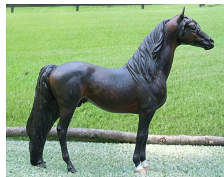
RES. CHAMPION REPAINT/HAIR OR SCULPTED MANE/TAIL: BLACK CAVIAR (BH)

Simple Remake & Repaint w/Hair M/T: Traditional or Larger (65): 1-Amantus VS (SN), 2-LBR Doc Sampedro (JG), 3-Walad (SN), 4-TS Bonnie Red (MP), 5-TS Dragon Warrior (MP), 6-Red Rebel (SSu), 7-RM Two-Tone Starburst (CM), 8-Rumneyhill Victoria (SN), 9-D.O. Go Wild (RN), 10-D.O. Sky Dreams (RN), HM-Ahvaz Zeenat (SN)