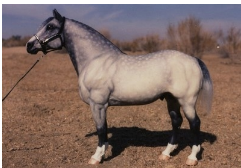
CHAMPION STOCK BREED: SMOKE BAR SYNDICATE (CC)

Other Pure/Mixed Stock Br. (5): 1-DQ Storm Warning (SSu), 2-Bourbon Express (SSu), 3-Montana Cat (LB), 4-Nabinabah The Bruce (CM), 5-The Cimarron Kid (JV)