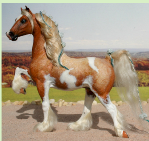
TS Autumn Nor'easter 25 Years Old!