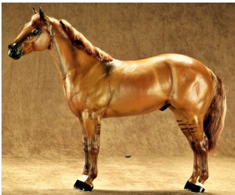
CHAMPION CREAM/DUN COLOR: KID'S SPANISH CASH (CM)

Dun/Gruella (12): 1-Kid's Spanish Cash (CM), 2-Mito's Something Wicked (SSu), 3-Confederate Gray (LB), 4-Seven S Rebel (LB), 5-Althea (SR), 6-Miss Smokum Royal (CM), 7-J's Muddy Dun (JG), 8-J's Copper Dun (JG), 9-Dakota Territory (JG), 10-KT Draublakken (JG), HM-Desert Medallion (RN)