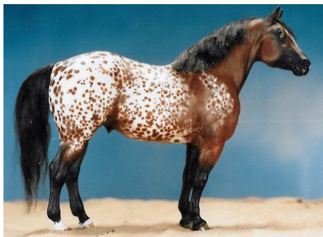
RES. CHAMPION MAJOR REMAKE/ REPAINT/HAIR OR SCULPTED M/T: ROCKING CHAIR RENEGADE REVEL (CM)

Extreme Remake & Repaint w/Hair M/T: Trad. or Larger (10): 1-Diamond Handsome Devil (BH), 2-Birchwood Geisha Boy (BP), 3-Diamond Flame (SSu), 4-Diamond Fancy Cat (CM), 5-RM Bay Bandit (APo), 6-Brookridge Diamond II (APo), 7-SD Conversano Diamond (APo), 8-Merry Mountain Mist (APo), 9-Rockledge Diamond Lark (CM), 10-Handsome Stranger (SSt)