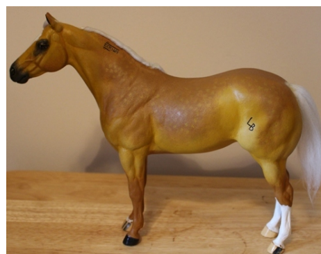
RESERVE CHAMPION CREAM/DUN COLOR: FIESTA JONES (LB)

Blanket Appaloosa (33): 1-Apache Magic Man (SSu), 2-Montana Cat (LB), 3-Arapaho Heights (JG), 4-Murphy's Law (APo), 5-Peppered Royal Smoke (JG), 6-Katarina (CM), 7-Dream Again (KM), 8-Oak's Dun Purrfect (CM), 9-Rock Ridge (JG), 10-Foxy Robin J (JG), HM-Class Action (CM)