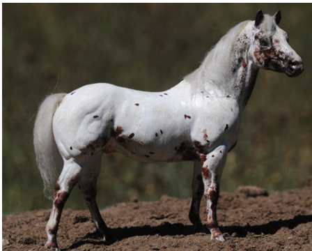
RESERVE CHAMPION STOCK BREED: CB'S STAR DEMON (SSu)

Arabian (18): 1-Tariifa (BH), 2-Fireo (NF), 3-