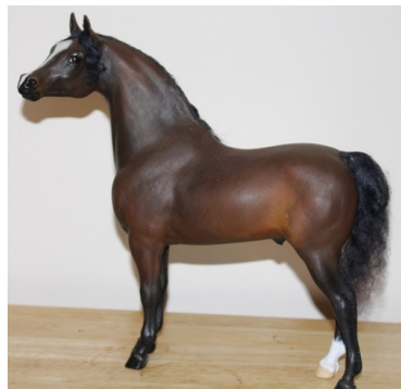
RES. CHAMPION SIMPLE REMAKE/ REPAINT/HAIR OR SCULPTED MANE/ TAIL: NHI VANYE I CHYYA (LB)

Major Remake & Repaint with Hair M/T: Trad. or Larger (8): 1-Rocking Chair Renegade Revel (CM), 2-Penny Arcade (BP), 3-Indiana Jones (LB), 4-Alconbury Starbringer (SSu), 5-Telemann (LB), 6-Brookridge Diamond (LB), 7-Diamond Legacy (SSu), 8-Moonlight Nugget (HC)