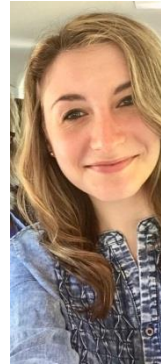
New Campus Minister