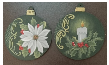
Poinsettia and Candle ornament Peggy Thomas January 2025