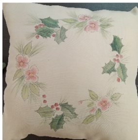
Holly on Pillow Peggy Thomas September