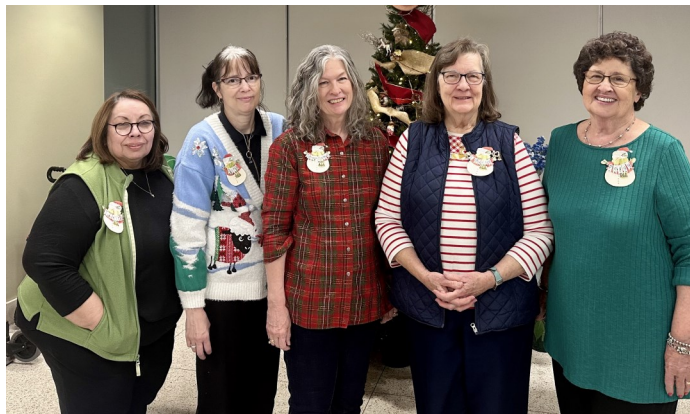
2024 Elected Officers