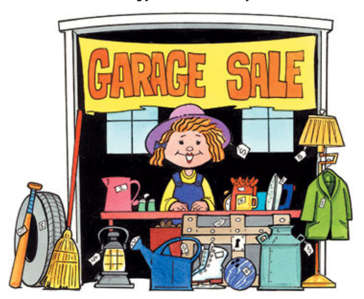
Signs can be purchased for $10 beginning October 1st at 7614 Rolling Rock St.