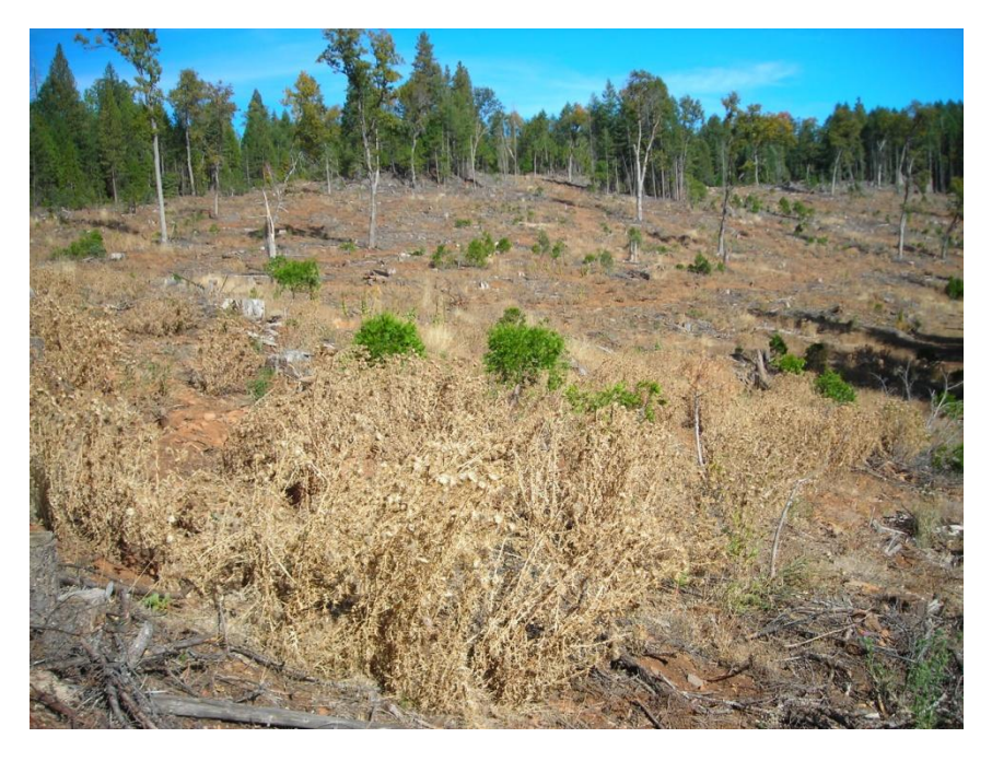
Little but invasive weeds can survive the herbicides used in a clearcut unit

Grown, diverse forests that take decades to hundreds of years to develop are replaced by plantations of tiny tree seedlings, usually of only one species. The monoculture plantations are subsequently sprayed with herbicides to reduce competition from any regeneration of the native plants that existed before the clearcut. The dearth of native plants and a diverse plant community has impacts on all species of life, from fungi to carnivores.