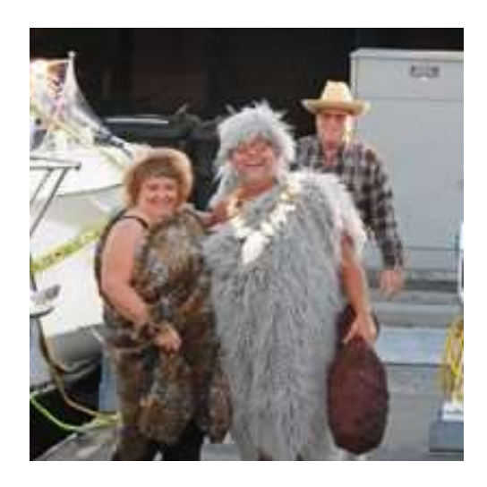
Best Couples Costume