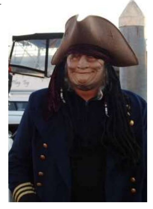
Best Mens Costume