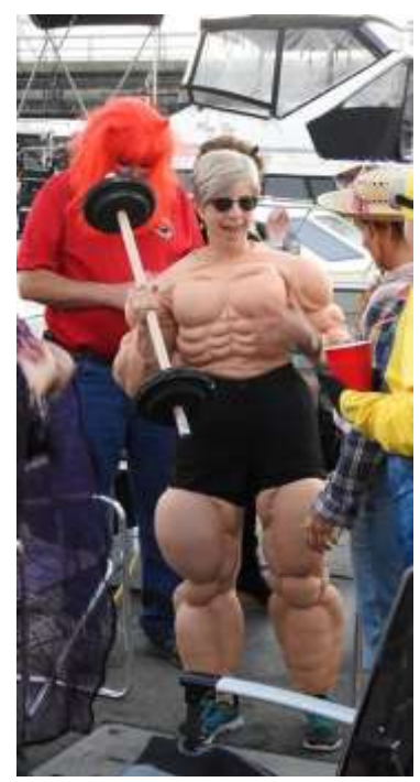
Best Female Costume