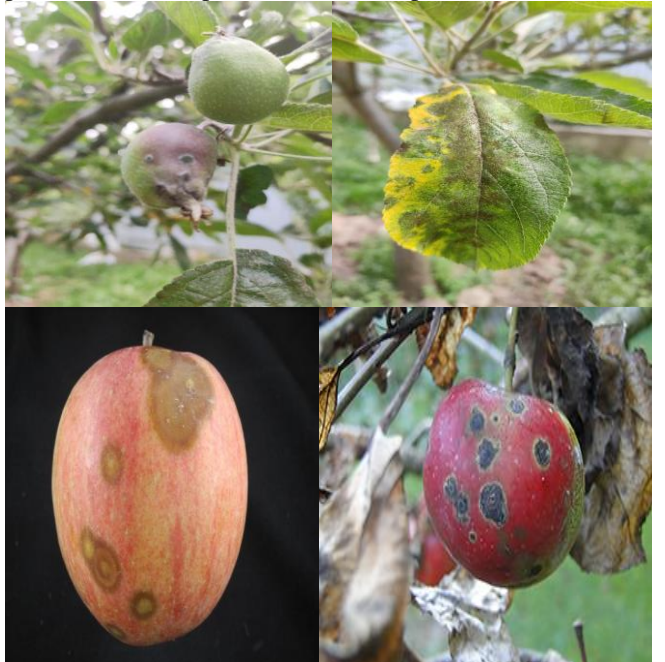
Fig 1. (Various diseases of apples)

proposed approach is composed of the following steps; in first step the images are segmented using K-Means clustering technique, in second step, some features are extracted from the segmented image, and finally, diseases are classified using a Multi-class Support Vector Machine (SVM). The early detection of plant diseases could be a valuable source of information for executing proper diseases detection, plant growth management strategies and disease control measures to prevent the development and further spread of diseases. [4]