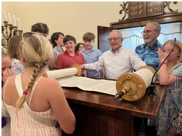
Belin Memorial Methodist Church Confirmation Class visits TBE 04/19/2024