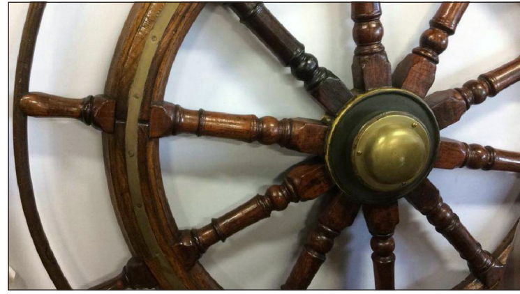
An antique brass, wood and iron ship's wheel with turned spokes, 5 feet in diameter.

The Benefit Shop is at 185 Kisco Avenue. For information, For information, 914-864-0707 or www.thebenefitshop.org.