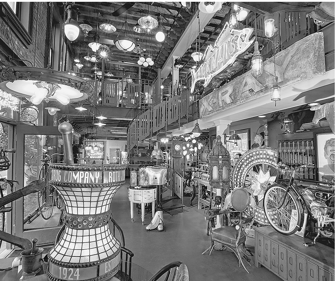
Radio Guy Antiques and Early Electrics Lighting can be found in our 150 year old landmark building on the Hudson River We are open 6 days a week, Monday through Saturday 9 to 4.