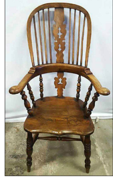
One of a set of six broad arm Windsor chairs originally purchased in Lancashire, England, circa 1840s, and curated for the estate by designer Bunny Williams.

The enamelware kitchen implements we see today originated in Germany and initially covered only the inside of the cast iron cooking vessels. The intent was to eliminate metallic and rust flavors, along with cutting down on scrubbing to clean. By the late 1800s Americans were massproducing far more attractive enameled cookware. Antique enamelware in turquoise, white spackle and vibrant blue, formed into pitchers, pots, canisters and coffee pots are now decorative and were present in the Nantucket