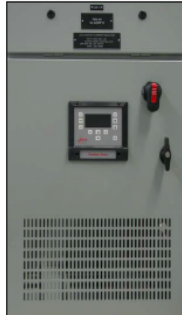
Fig. 1 10 kW Ferroresonant Regulator